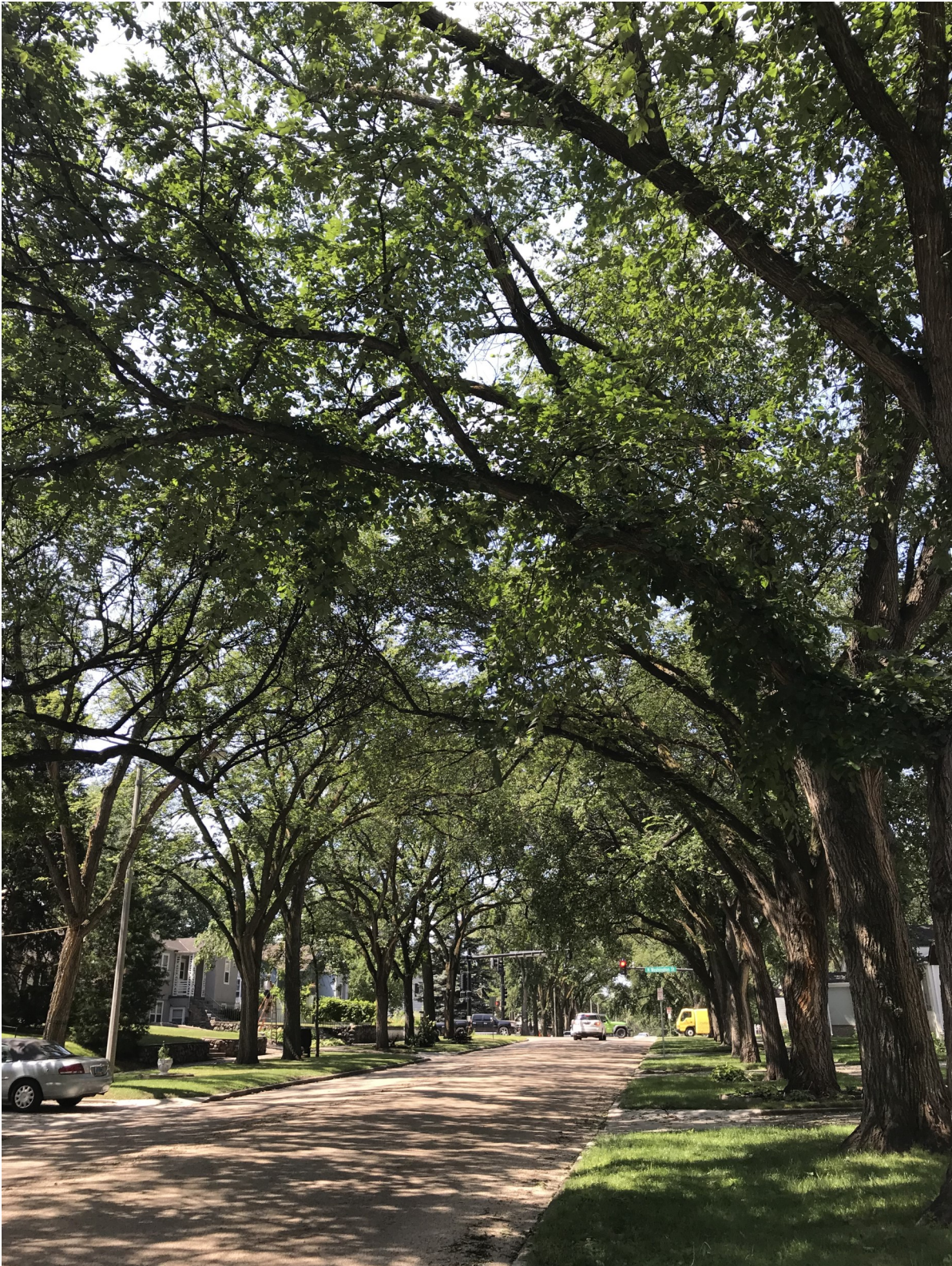
American elm lined street, Bismarck 2019