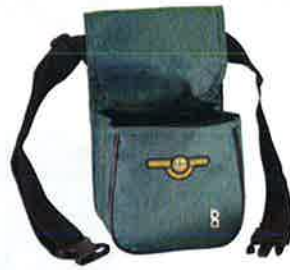
4-H Shooting Pouch