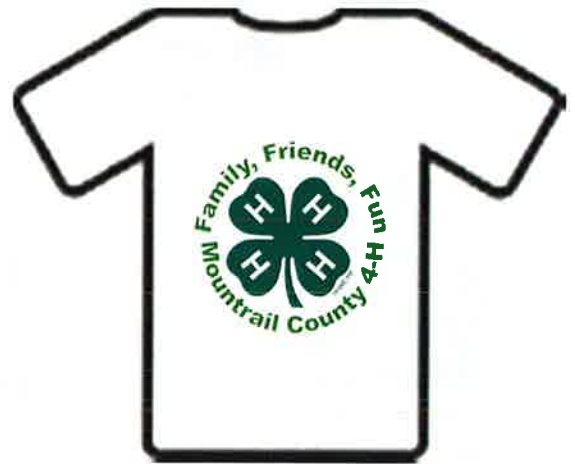
4-H hoodies will be royal blue with white lettering.