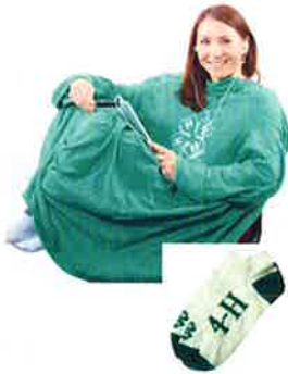
4-H Socks & 4-H Clover Cuddly