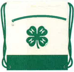
Cotton Canvas Cinch Bag 17.35" x 13.5 "