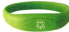
4GB Wristband Flash Drive