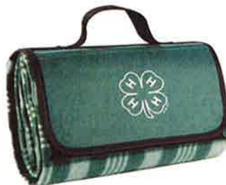
4-H Park Blanket