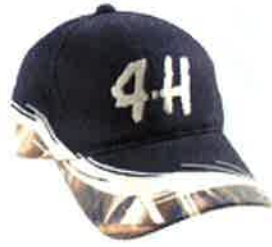
4-H Great Outdoors Cap