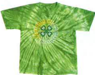
Tie Dye shirt (adult sizes only)