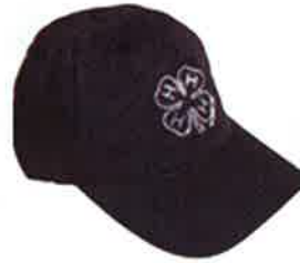
Black 4-H Rhinestone Cap