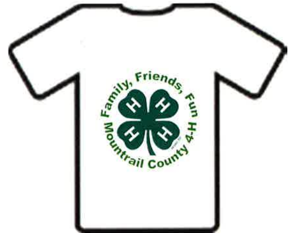
4-H t-shirts will be royal blue with white lettering.