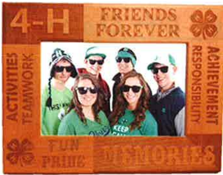
4-H Friends Forever Wood Picture Frame (4X6)