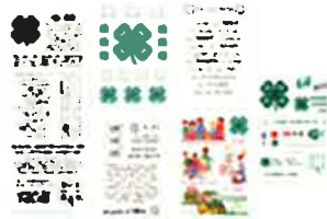
4-H Super Sticker Kit (50+ stickers) & 3 different patterned sheets