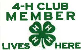
Metal sign 10"x14" (2 holes for mounting)