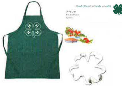
Cotton Apron, 25 recipe cards, clover cookie cutter