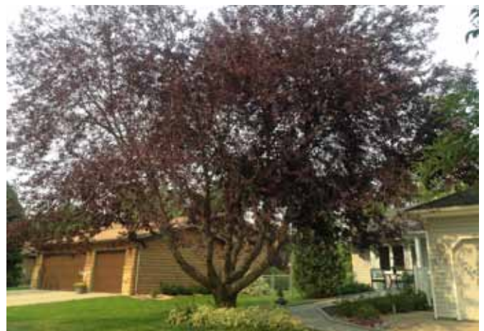
This beautiful specimen of the Canada Red cherry tree is most likely crossbred with a Mayday cherry tree, indicated by the thick trunk.

The trees can grow 20 to 30 feet tall with a spread of 18 to 25 feet. It flowers in spring, usually in early May, with fragrant white flowers that grow on racemes and fill the air around the tree with a light, floral fragrance, sort of like God's Febreze. The flowers turn into dark red 1/3-inch round fruits that are face-crinkling bitter to eat (hence, the name chokecherry), but have been used for years