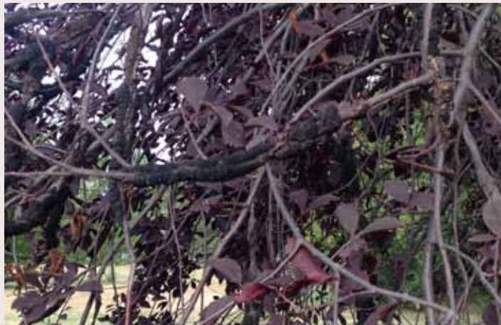
Black knot fungus is spread through spores, and will girdle branches, eventually killing them.

the area, there's a pretty good chance it will spread," Morgenson said.