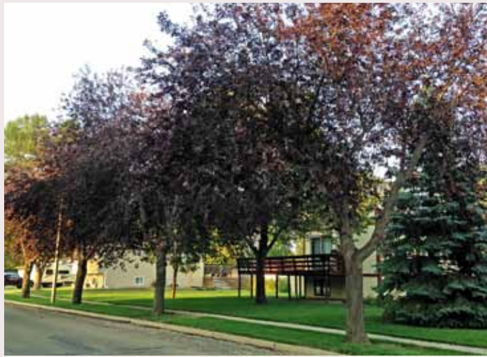
Canada Red cherry trees were very popular for backyard and boulevard plantings in the 1980s and 1990s, so neighborhoods built during those decades will have plenty of them. Most cities no longer use them for boulevard plantings.

"If there's a number of chokecherry trees in