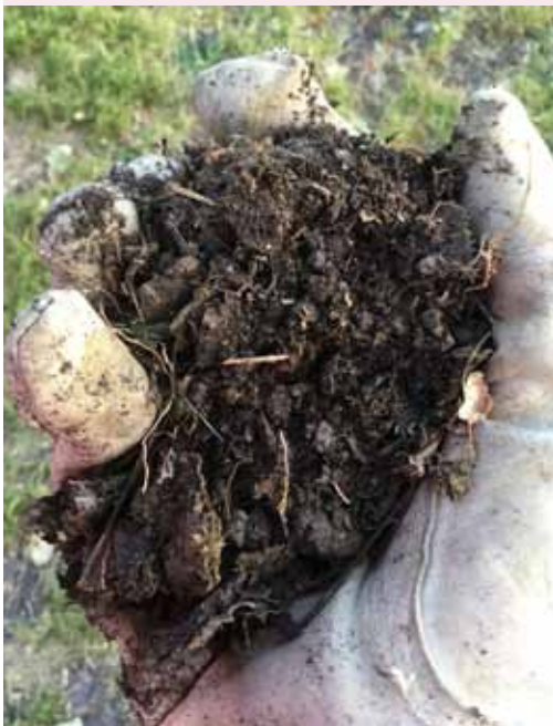
Photo is of 1 year old leaf mold.

Leaf mold is high in carbon and it conditions the soil, lacing it with fungi and