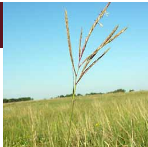
Big Bluestem.

planning, planting and management to restore the complexity of these biologically rich grasslands.