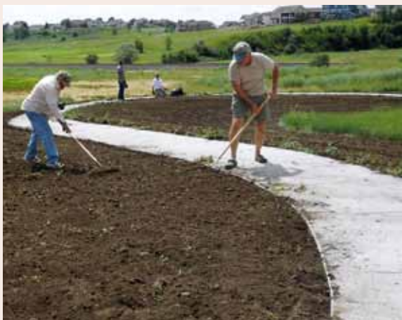
Volunteers from the Lewis and Clark Wildlife Club prepared the pollinator garden site for planting.

Developing Bismarck's Pollinator Garden has been a wonderful partnership with many individuals and groups stepping forward to lend a hand. Partners include Bismarck Parks and Recreation District, USDA's Natural Resources Conservation Service, USDA's Plant Material Center, and the Xerces Society.