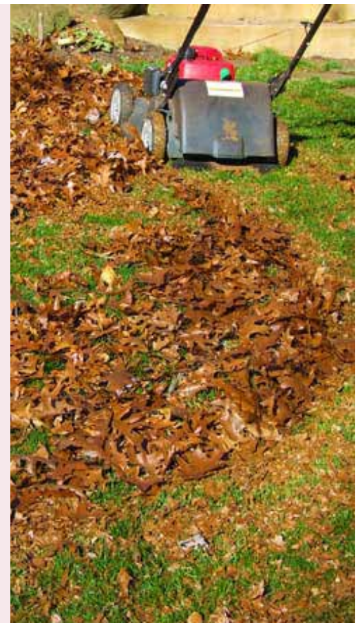
Mulching leaves with a push mowers.

A fine layer of chopped leaves will break down over the winter and be incorporated