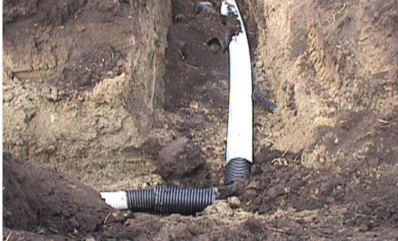
"Sock" on the tile.