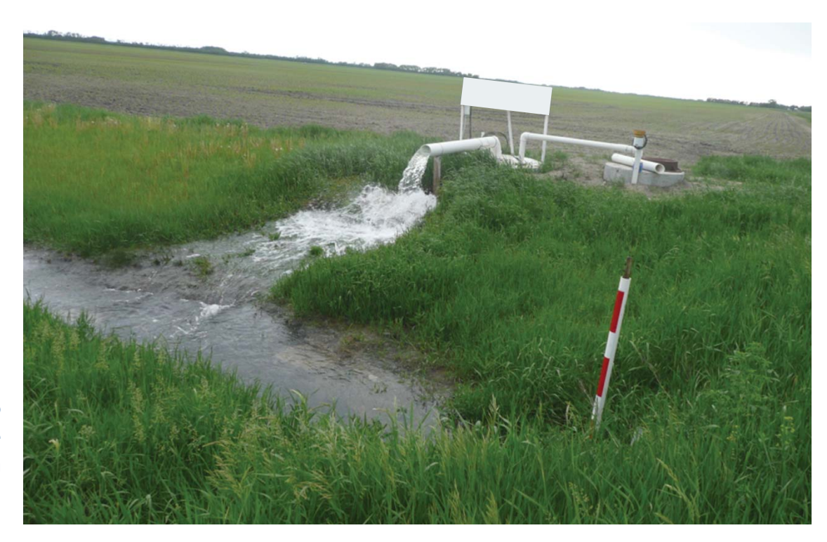
Drainage pump station discharge mixes with surface runoff.

such as tile drainage "causes" flooding or tile drainage "prevents" flooding oversimplify the issue.