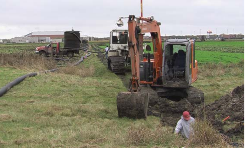
A lot of equipment is required to install tile drainage.