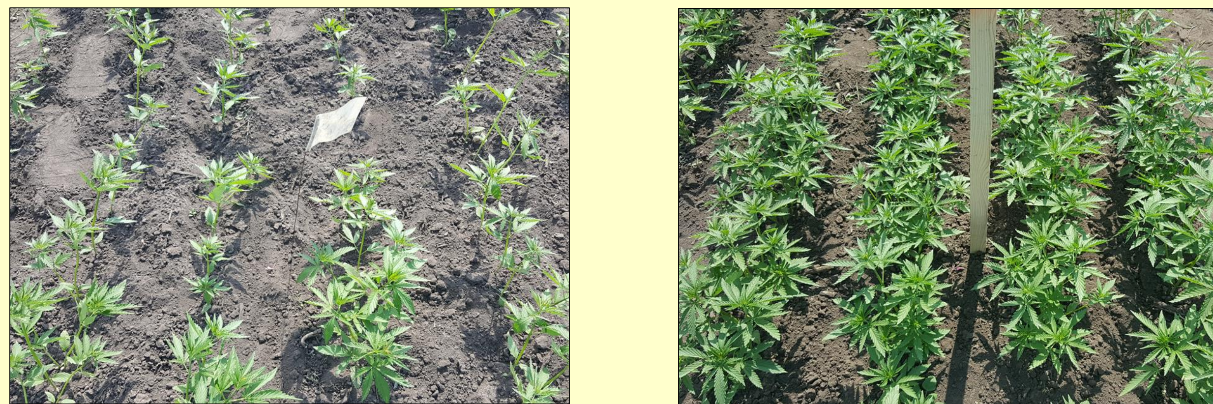
Fig. 2. Plant density 26 plants/m 2 (left photo); and 130 plants/m 2 (right photo); photos taken 21 days after planting