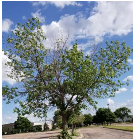
A thin crown, with or without basal sprouts, is a symptom of EAB and other ash maladies.

established, it cannot be eradicated, and EAB continues to be discovered closer to our state.