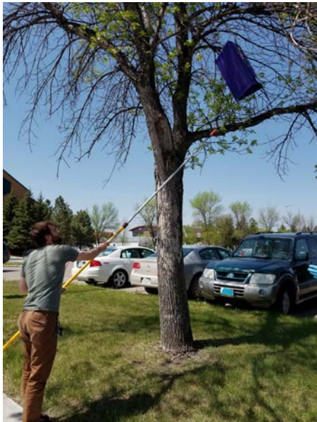
Forest Health Intern Owen Schneider places a purple EAB trap in an ash tree in Fargo.

The North Dakota Forest Service (NDFS) played a big role in the North Dakota Department of Agriculture's (NDDA) Emerald Ash Borer (EAB) trapping efforts in 2018. We placed 127 traps in 27 counties in late May, checked them and changed lures in July, then checked and removed the traps in August.