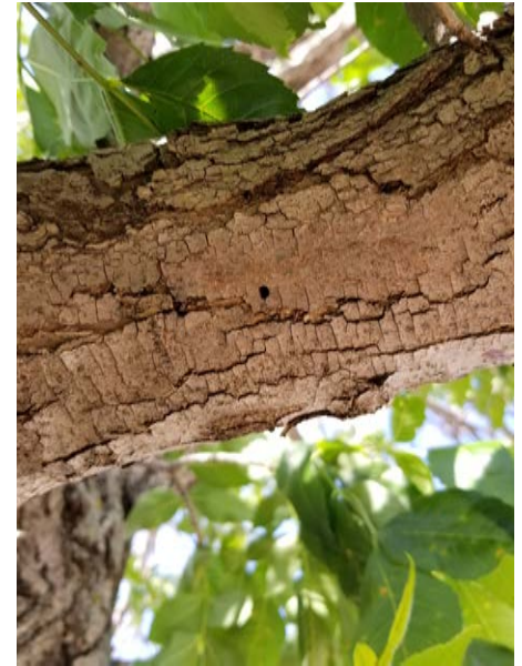
Adult EAB beetles leave a D-shaped exit hole about 1/8-inch wide in ash tree bark.

of ash trees will have some protection from EAB.