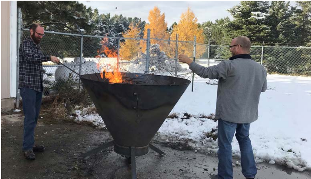
ND Forest Service staff load invasive buckthorn into the first biochar kiln fabricated to produce charcoal to be used as a soil amendment.