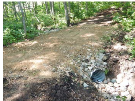
New “water crossing” on a state trail.

Plans are underway to complete additional trail improvement needs