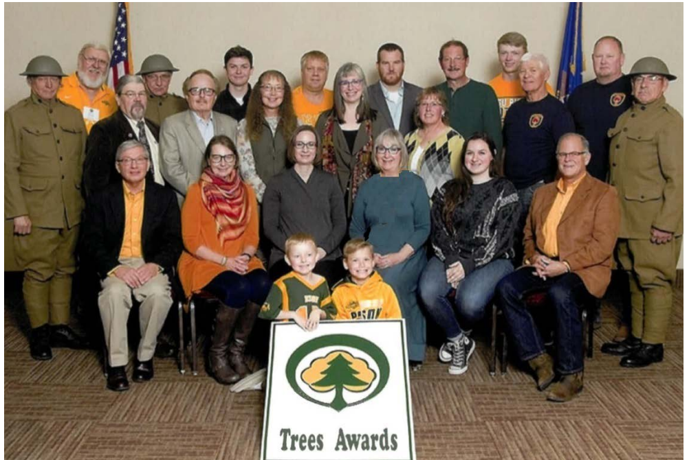
Trees Award winners from across the state were recognized at the Fargodome by North Dakota State University and the North Dakota Forest Service.