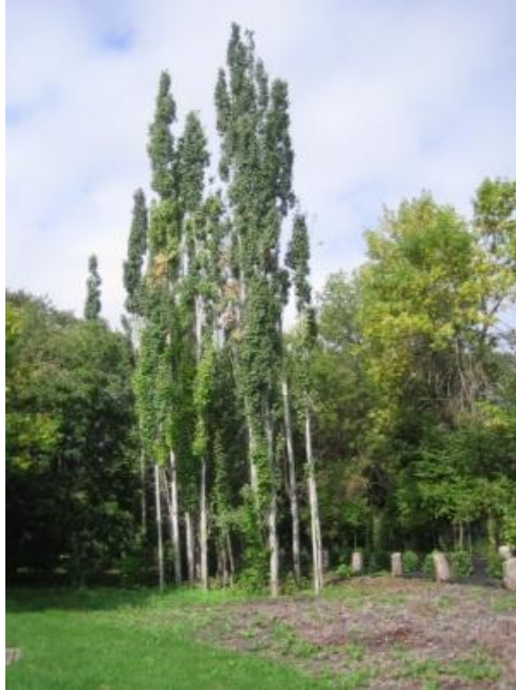
Champion Swedish Aspen Neal Holland, Owner Harwood, ND

Species Circumference at 4-1/2 feet (feet) Height (feet) Average Crown Spread (feet) Total Points