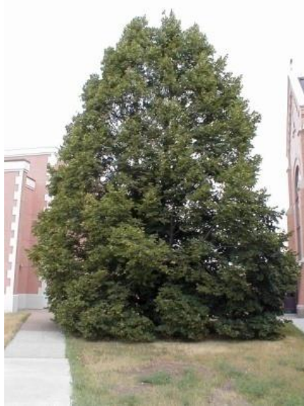
Champion Eastern Hemlock Assumption Abbey, Owner Richardton, ND

Species Circumference at 4-1/2 feet (feet) Height (feet) Average Crown Spread (feet) Total Points