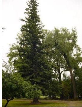
Champion White Spruce Clyde and Carol Reilly, Owners Crystal, ND

Species Circumference at 4-1/2 feet (feet) Height (feet) Average Crown Spread (feet) Total Points