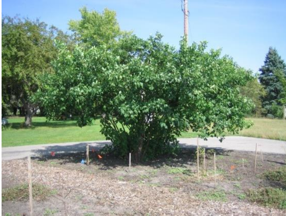
Second place Hoptree City of Fargo, Owner Fargo, ND

Species Circumference at 4-1/2 feet (feet) Height (feet) Average Crown Spread (feet) Total Points