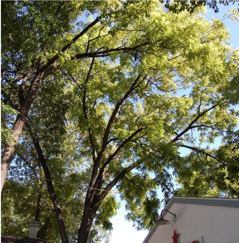
Champion Black Walnut Fargo, ND