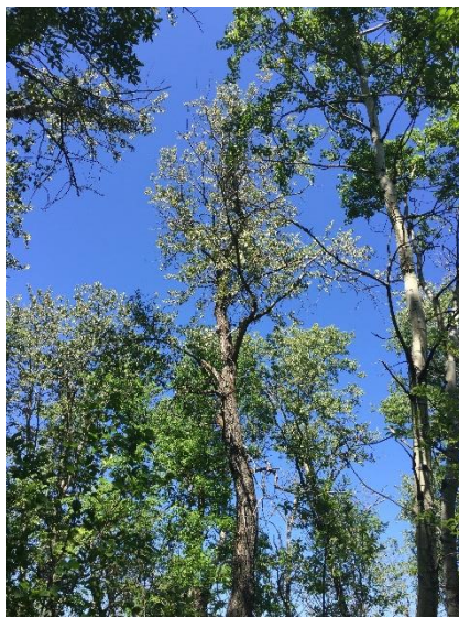
Champion Balsam Poplar Owner: Rick Ennen, Menoken, ND The tree is located in the Turtle Mountains

Location: Turtle Mountains, Bottineau County, N 48 52.240' - W 100 18.671' Owner: Rick Ennen, 18100 22 nd Ave SE, Menoken, ND 58558 Nominator: Rick Ennen, Menoken, ND