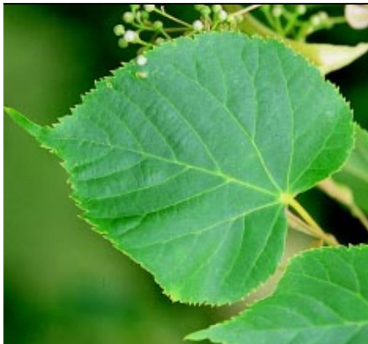
Linden trees have large heart-shaped leaves.