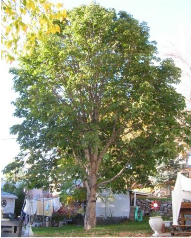
Champion European (Horse) Chestnut Peter Feist, Owner Bismarck, ND

Species Circumference at 4-1/2 feet (feet) Height (feet) Average Crown Spread (feet) Total Points