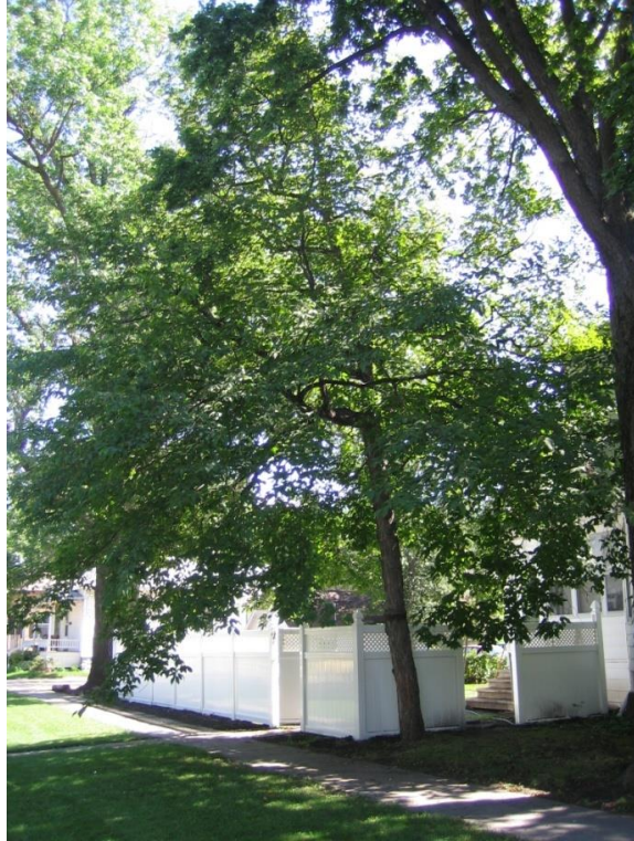
Champion Ironwood Jeff Moss, Owner Fargo, ND

Species Circumference at 4-1/2 feet (feet) Height (feet) Average Crown Spread (feet) Total Points