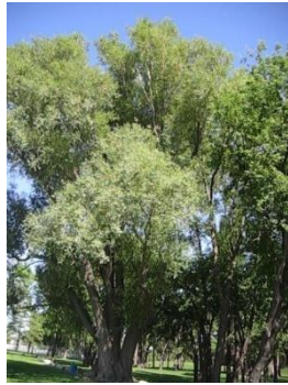
Champion Golden Willow Fargo Parks Department, Owner Fargo, ND