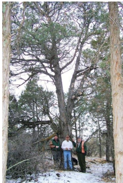
Champion Rocky Mountain Juniper USDA Forest Service, Owner McKenzie County