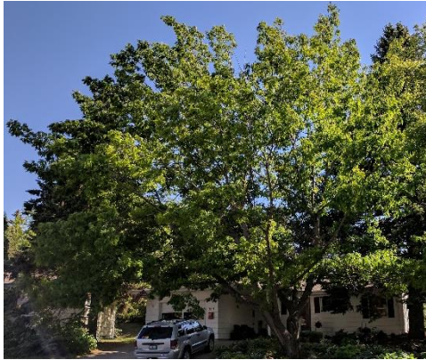
Champion Red Oak Jim Fuglie and Lillian Crook, Owners Bismarck, ND

Species Circumference at 4-1/2 feet (feet) Height (feet) Average Crown Spread (feet) Total Points