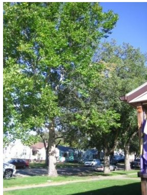
Champion Sycamore City of Bismarck, Owner Bismarck, ND