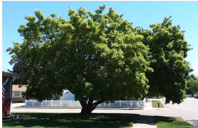
Champion Amur Maple Glaser Properties, Owner Bismarck, ND