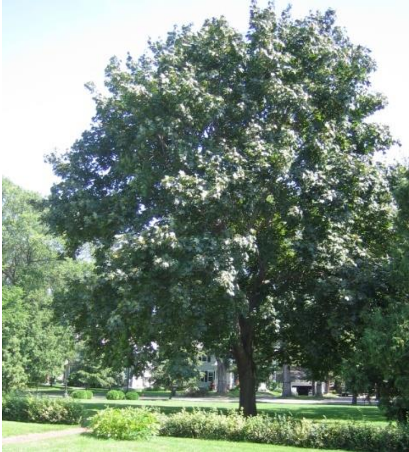
Champion Sugar Maple Michael Weiner, Owner Fargo, ND

Species Circumference at 4-1/2 feet (feet) Height (feet) Average Crown Spread (feet) Total Points