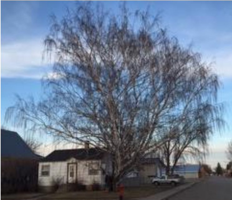
Champion Weeping White Birch James Gove, Owner Larimore, ND

Species Circumference at 4-1/2 feet (feet) Height (feet) Average Crown Spread (feet) Total Points