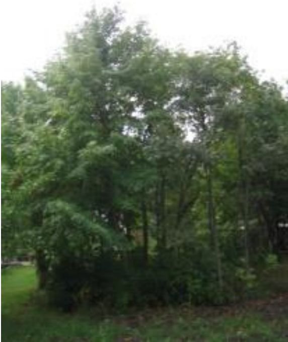
Champion Mongolian Oak North Dakota State University, Owner Fargo, ND