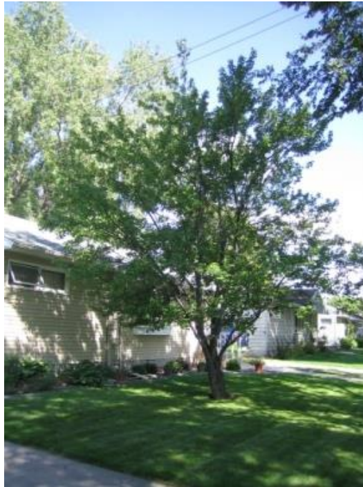
Champion Red Maple Willard Bahr, Owner Fargo, ND

Species Circumference at 4-1/2 feet (feet) Height (feet) Average Crown Spread (feet) Total Points