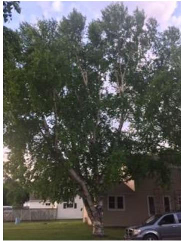
Champion Paper Birch Jen Varriano, Owner Larimore, ND

Species Circumference at 4-1/2 feet (feet) Height (feet) Average Crown Spread (feet) Total Points