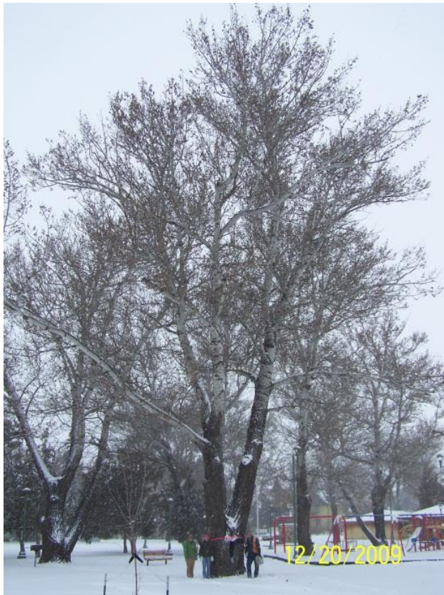
Champion White Poplar City of Bowman, Owner Bowman, ND