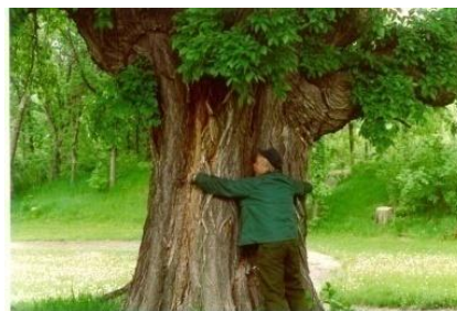
Second Place American elm tree City of Lisbon, Owner Lisbon, ND