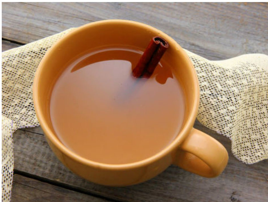
A mug of hot apple cider is a special treat on a cold day.

Know your Hardiness Zone (3 or 4). Standard rootstocks are usually used in Zone 3. Semi-dwarf rootstocks are often used in Zone 4 because they bear crops earlier (4 years compared to up to 8 years for standard rootstocks).