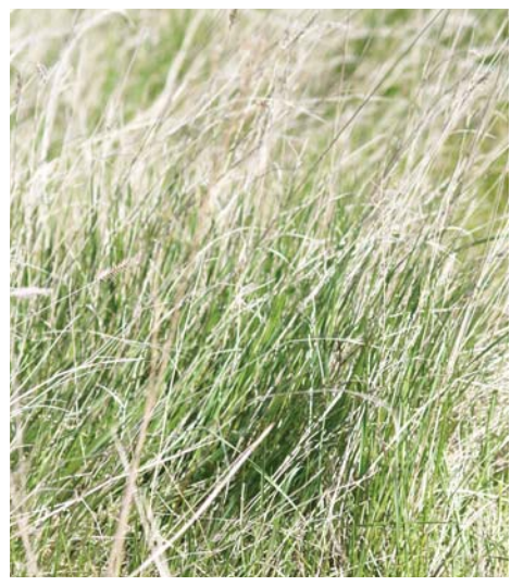
Plants transfer energy from the sun to feed soil microbes that keep soil healthy and provide livestock feed.

Graphic by David Haasser, NDSU Agricultural Communication: https://www.ag.ndsu.edu/news/columns/beeftalk/beeftalk-healthysoil-buffers-human-inadequacies/