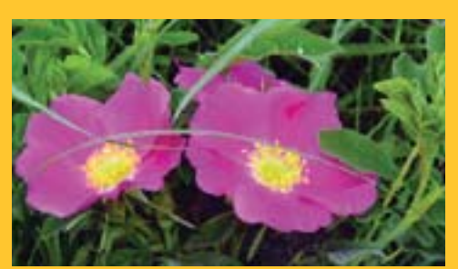
Prairie wild rose

The root system has very stout deep vertical roots that descend 10 to12 feet below the soil surface along with widespreading horizontal roots near the soil surface. This root system allows Prairie Wild Rose to increase during drought