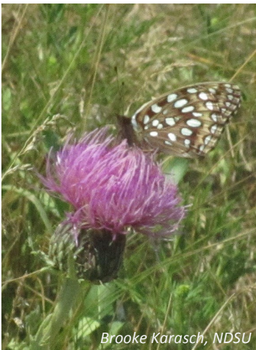
Aphrodite fritillary ( Speyeria aphrodite ), nectaring on a thistle ( Cirsium spp.)

Most of the Great Plains are what we might refer to as a “working landscape.” A majority of the native prairies have been converted to row cropland, and what’s left is often used as grazing land for cattle. Luckily, the Great Plains evolved with large herbivores, and studies have shown that grazing differences between native bison and non-native cattle are minimal (see Allred et al., 2011). However, the Great