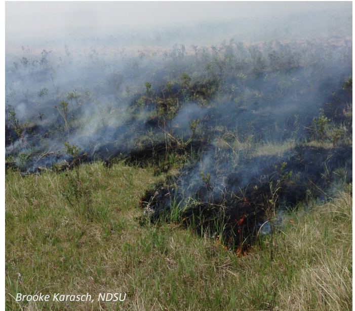
Brooke Karasch, NDSU

Pollinators are in global decline. Because they provide a variety of important ecosystem services, namely pollination of native plants and crops, it is important to understand and try to mitigate the causes of pollinator loss. A number of factors are driving declines, including pesticide overuse, climate change, and habitat degradation. In the North American Great Plains, habitat degradation is an important factor in many species' declines.