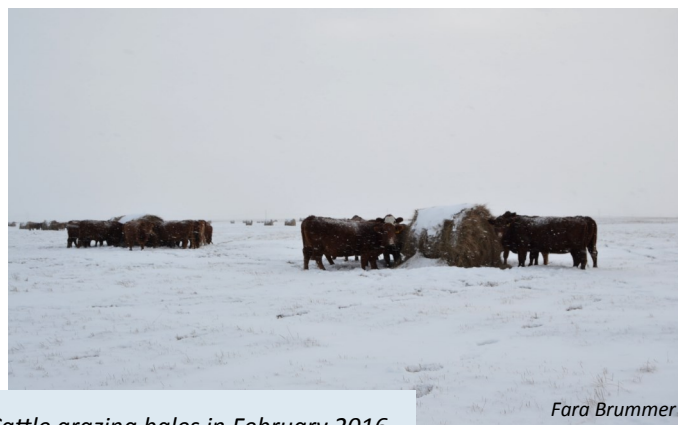
Cattle grazing bales in February 2016