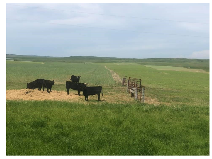
NDSU Central Grasslands Research Extension Center 2020 Annual Report