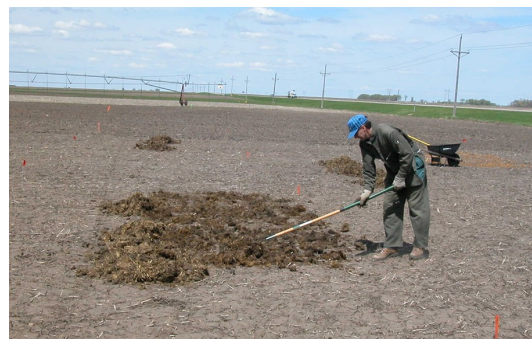
Applying manure to a research plot.