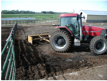
Pen cleaning with a box scraper.

Allowing manure to build up in barnyards and open lots when it is wet makes it harder for animals to move and feed. They use more energy to walk, and contribute more pollutants to runoff when it rains. Collect manure from barnyards and lots monthly to reduce buildup and