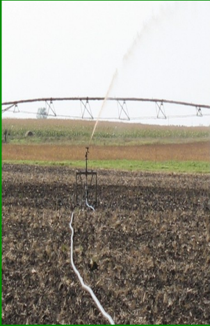
Traveling gun applying containment pond effluent on a field.

“During the spring melt, monitor your pond and record its level regularly. Inspect the diversions and dikes for erosion...”