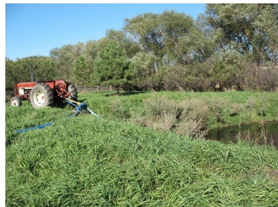
Pumping water effluent from a containment pond.