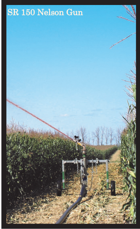
SR 150 Nelson Gun