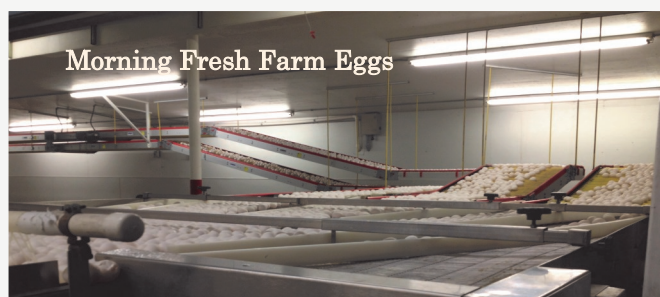
Morning Fresh Farm Eggs

For more information about renting the traveling-gun irrigation system, contact Lori Frank at 701-845-3114 extension 3. Also, check out the NDSU Extension publication NM-1626 "Containment Pond Management" found here: http://www.ag.ndsu.edu/pubs/ansci/waste/nm1626.pdf .