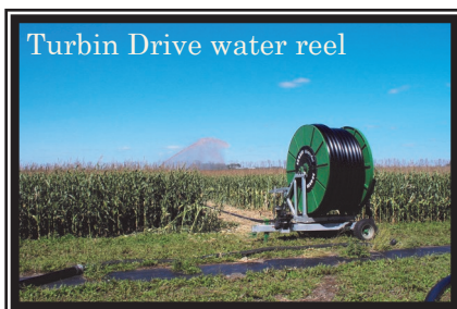
Turbin Drive water reel