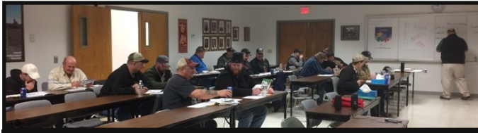
Learning about personality preferences develops better communication with employees and customers.

The 3 rd Annual North Dakota Custom Manure Haulers workshop was held on Wednesday, February 22 nd in Mandan.