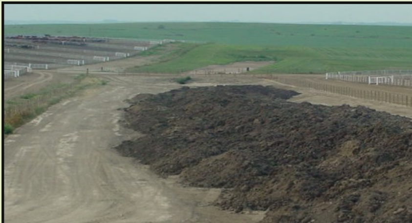
Fifty to 85% of manure's dry matter is organic material. Organic matter is the energy source essential to a healthy soil microbial system.

However, the value of manure's carbon (or organic matter) remains a mystery to many managers of crop and soil systems. The carbon in manure is a beneficial element for soils, leading to greater water infiltration, less runoff and erosion, and improved soil drought tolerance. These advantages are generally connected with changes in soil structure including greater aggregation of soil particles. In addition, manure's properties have been reported as benefiting soil pH, diversity of soil organism diversity, disease suppression, and cycling of soil nutrients.