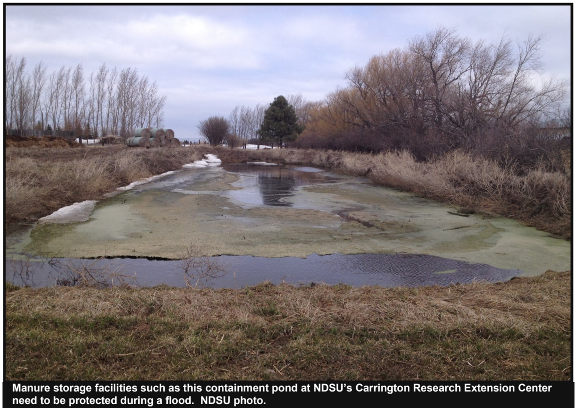
Manure storage facilities such as this containment pond at NDSU's Carrington Research Extension Center need to be protected during a flood.

If your runoff pond does fill up, it is best to wait to pump it until the water can be applied to dry cropland, hay land or pasture. When possible, a sample of the runoff water should be tested prior to application. Contact your local extension agent for a list