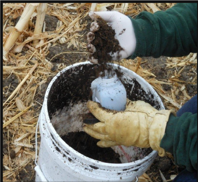
Accurate manure sampling is the first step in proper spreading.

Mother Nature not so kindly reminded us in December and January what a real North Dakota winter can be like. Because of that, there will be a lot of manure to be hauled this spring and fall – but that’s not necessarily a bad thing because we know manure makes a great fertilizer and soil amendment! However, we want to make sure we’re using only the nutrients we need and not creating a potential pollution event.