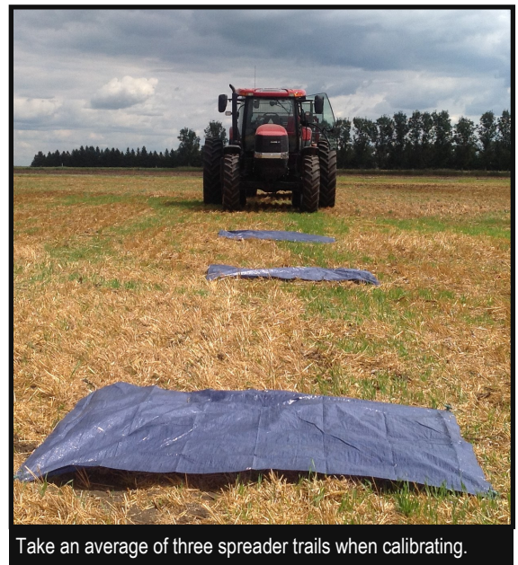
Take an average of three spreader trails when calibrating.

Do this 3 times or set up 3 separate sheets and use an average of the weights.