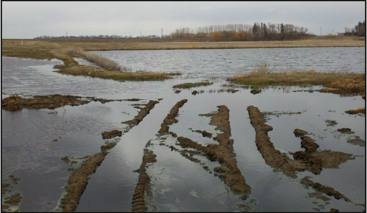
An uncontrolled overflow can damage the pond structure.

of laboratories that can analyze manure samples. Runoff water can often be applied up to the infiltration rate of the soil.