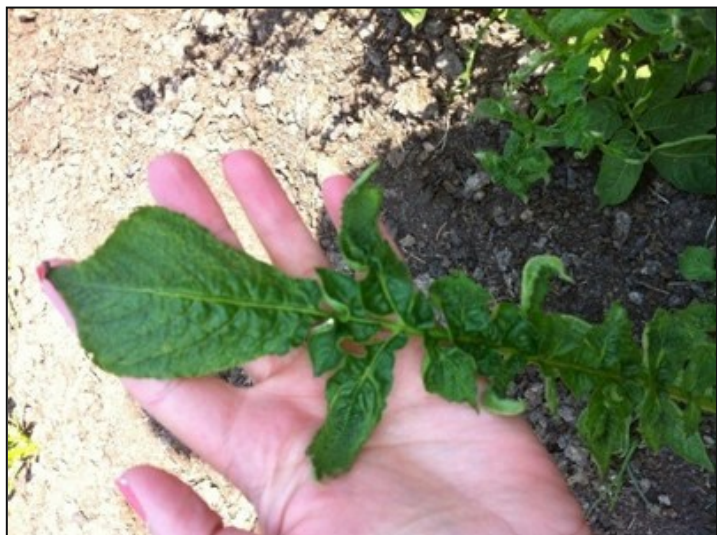
Example of plant damage resulting from application of manure containing a persistent herbicide.

While persistent products are praised by many because of their effectiveness, they are also cursed by many...because of their effectiveness. Typically those cursing don't know they are dealing with a persistent herbicide until damage to desirable plants occurs. When we paint a fence we can see the paint persists for many years; however when we spray weeds we do not see the herbicide persist in the soil or on the plant vegetation.