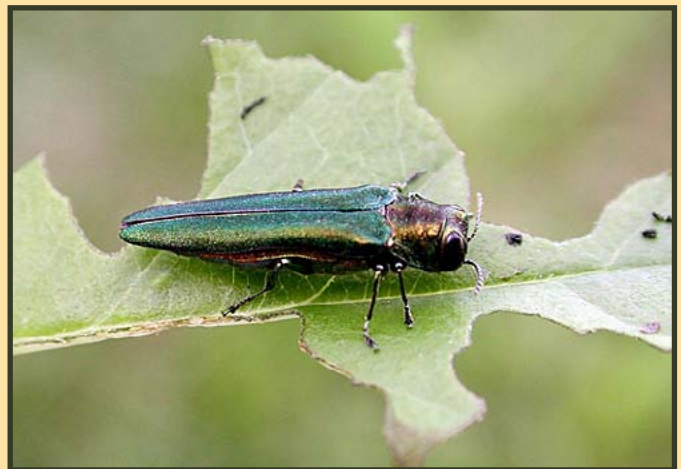
Figure 10. Emerald ash borer adult feeding on an ash leaf

Adults live for only three to six weeks and feed on foliage for one to two weeks prior to mating. Foliar feeding by EAB adults causes little damage to the ash tree (Figure 10). They mate and repeat the life cycle.