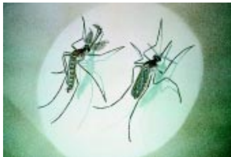
Male (left) and female (right) Culex mosquitoes.