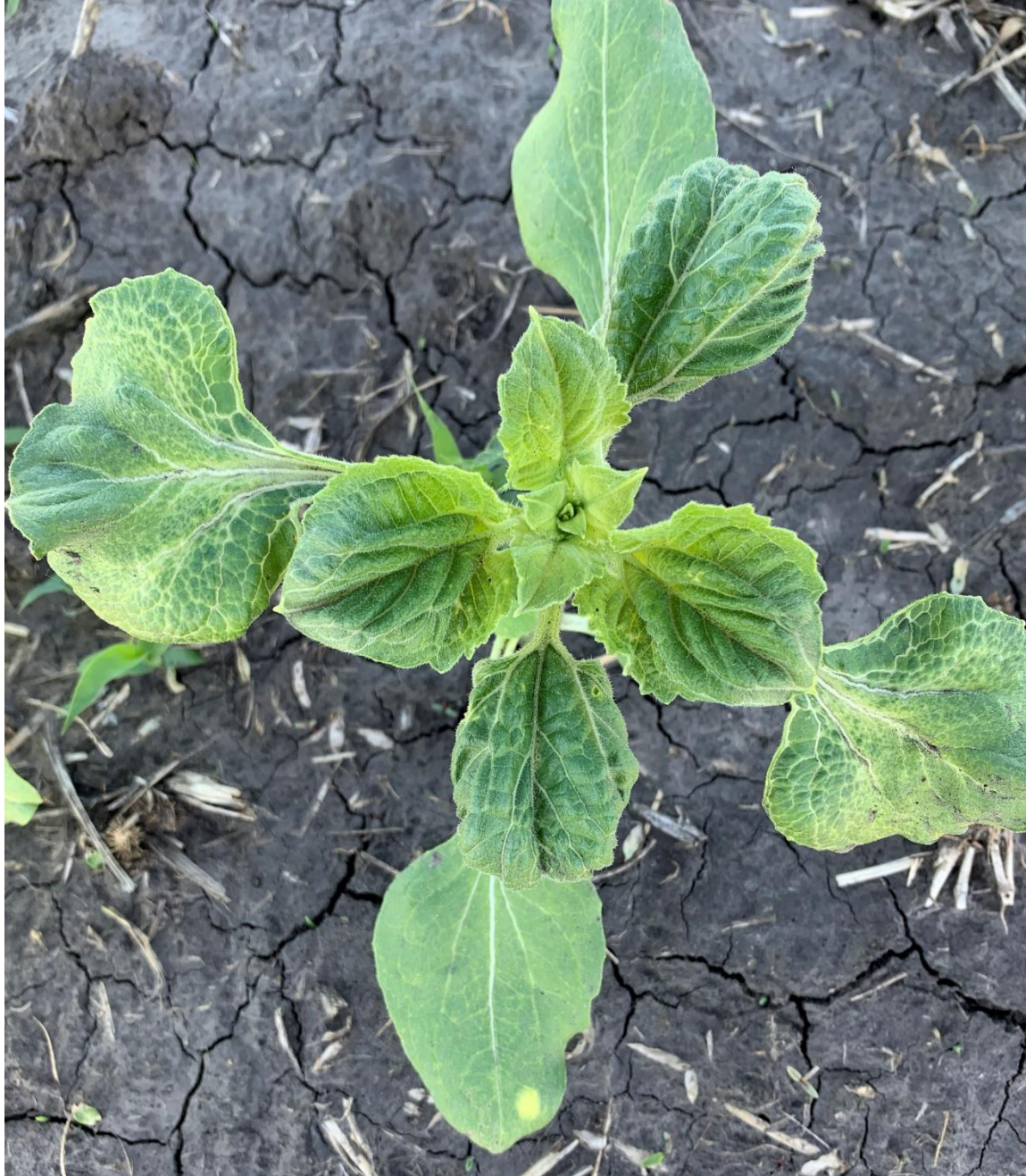
Injury symptoms with early planted sunflower, Prosper, 2021.