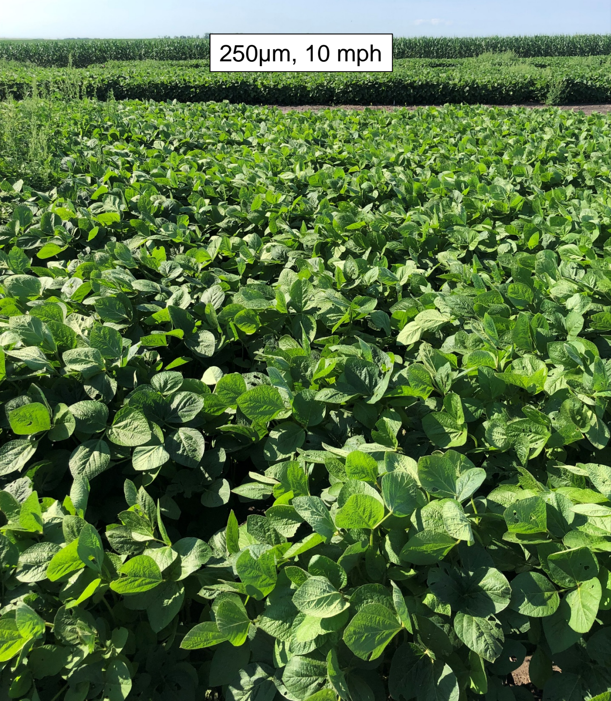
250 \mu m, 10 mph