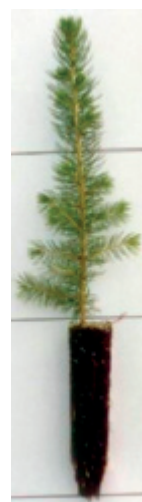
Container (Plug) Stock