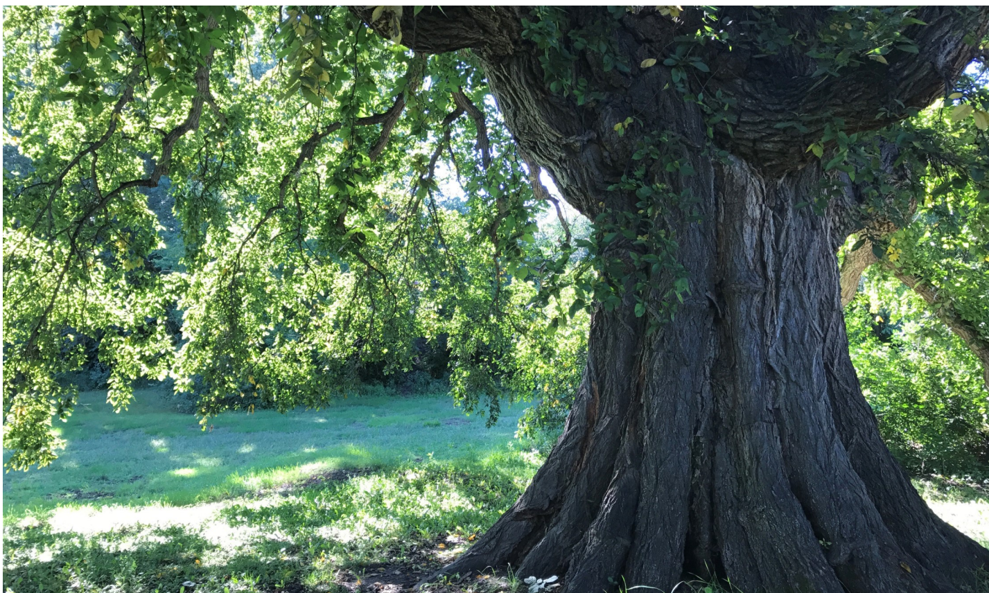
Champion American elm, Lisbon ND