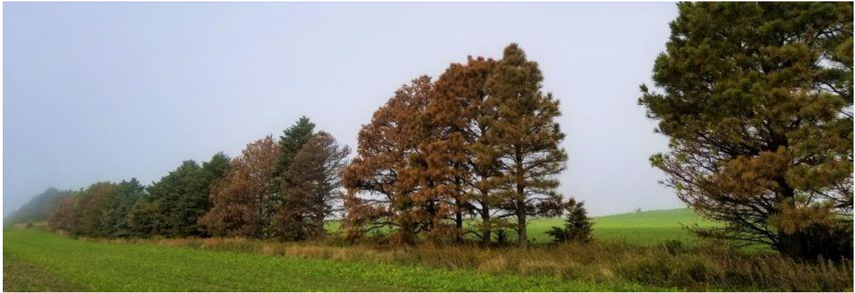
Figure 2: Image of frequently observed pine mortality in central and eastern North Dakota conservation plantings. Late 2019 growing season rainfall and heavy snowfall caused waterlogging soil conditions through the winter and early spring, resulting in severe physiological injury and death.

growth, which elevated tree stress in many locations. This circumstance may yet manifest as continued tree health issues during the 2021 growing seasons.