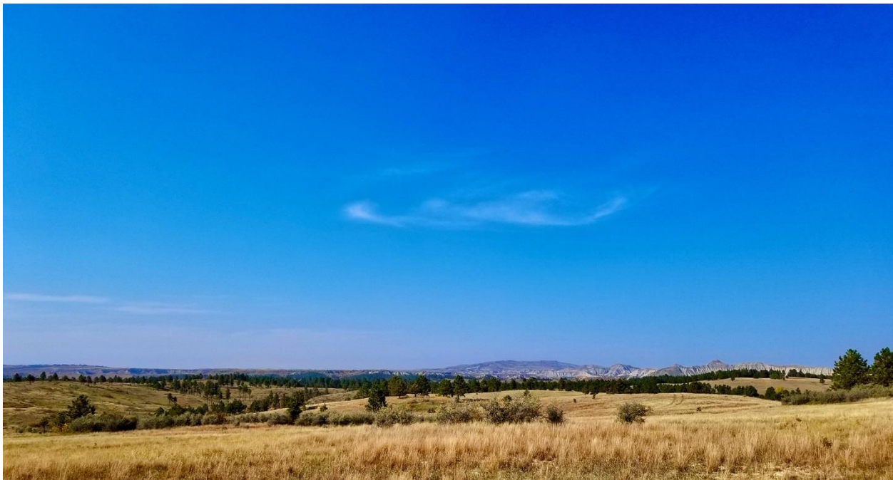
Theodore Roosevelt National Park in September.

This report summarizes forest health observations and program activities in North Dakota for 2020 and includes an overview of notable forest health issues. The information in this report comes from site visits, forest health surveys and reports, and personal communication with natural resource and community forestry professionals. North Dakota contains approximately 808,701 acres of forestland, which accounts for just under two percent of the state’s land area (Forests of North Dakota 2019). The top five tree species in the state by volume are cottonwood, bur oak, green ash, quaking aspen, and Rocky Mountain juniper. Conservation plantings, such as windbreaks and living snow fences, are a significant linear tree resource, totaling as much as 55,000 miles. Community trees provide valuable ecosystem services in the northern Plains environment. Four college campuses have achieved Tree Campus USA designation and fifty-three cities qualify for Tree City USA.