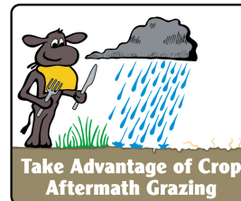
Take Advantage of Crop Aftermath Grazing