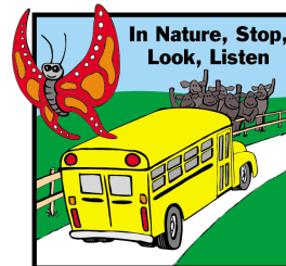
In Nature, Stop, Look, Listen