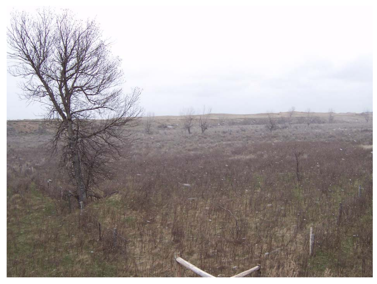
Figure 18. Overflow Ecological Site, located in Sec. 11, T 138 N, R 101 W, exclosure of 2.90 acres, built in 1937, looking East.