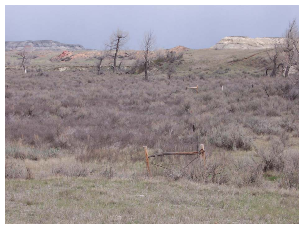
Figure 17. Overflow Ecological Site, located in Sec. 11, T 138 N, R 101 W, exclosure of 2.90 acres, built in 1937, looking North.