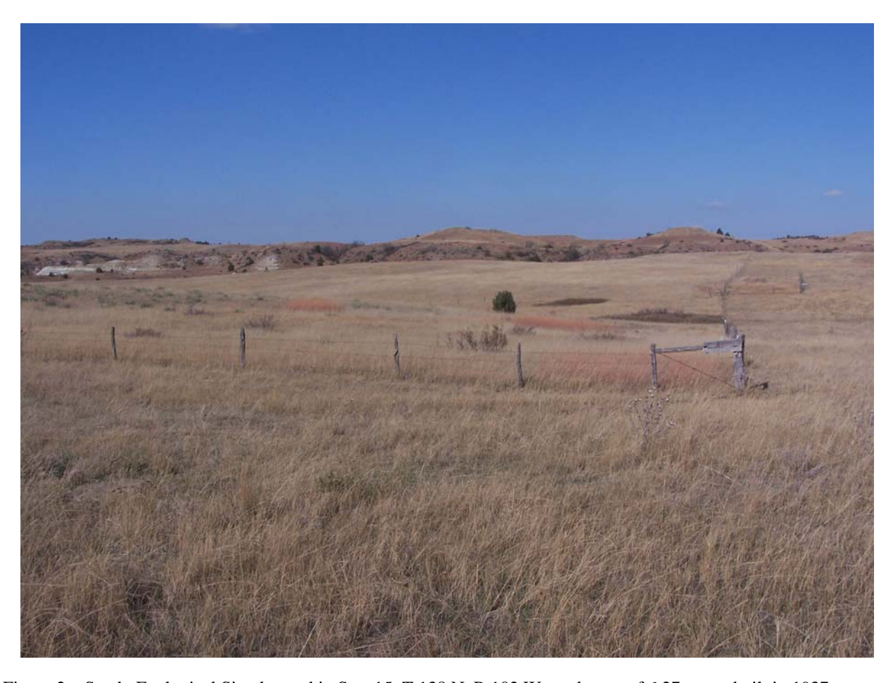
Figure 2. Sandy Ecological Site, located in Sec. 15, T 138 N, R 102 W, exclosure of 6.27 acres, built in 1937, looking North.