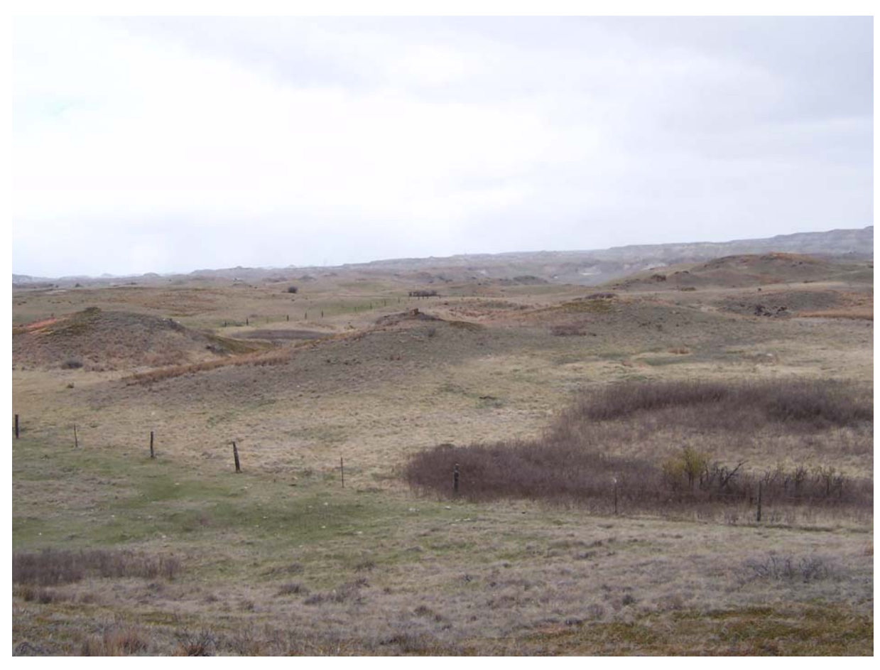
Figure 12. Silty Ecological Site, located in Sec. 3, T 138 N, R 101 W, exclosure of 14.10 acres, built in 1938, looking North.