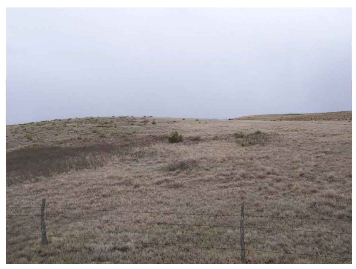
Figure 4. Sandy Ecological Site, located in Sec. 15, T 138 N, R 102 W, exclosure of 6.27 acres, built in 1937, looking South.