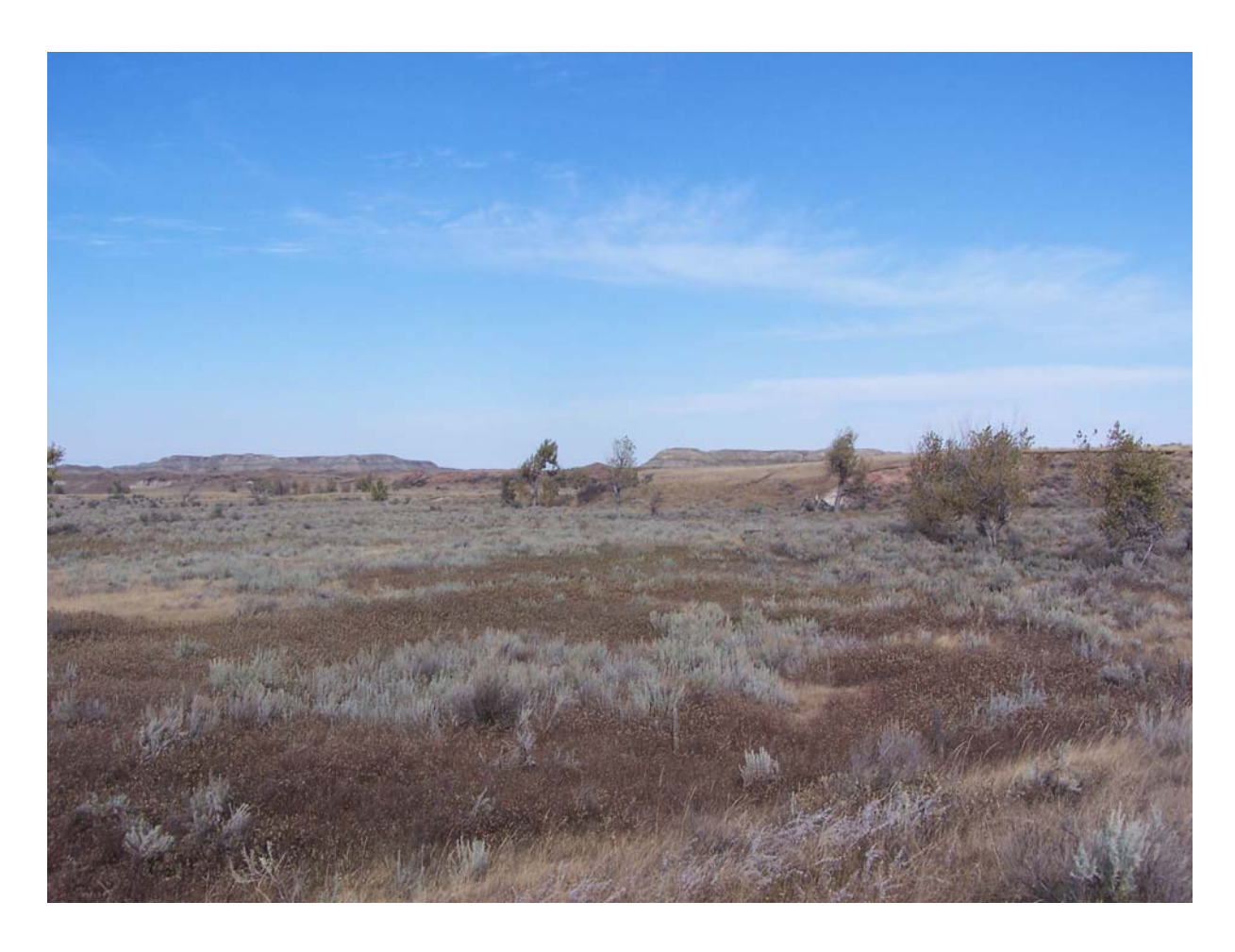
Figure 20. Overflow Ecological Site, exclosure with increased woody vegetation.