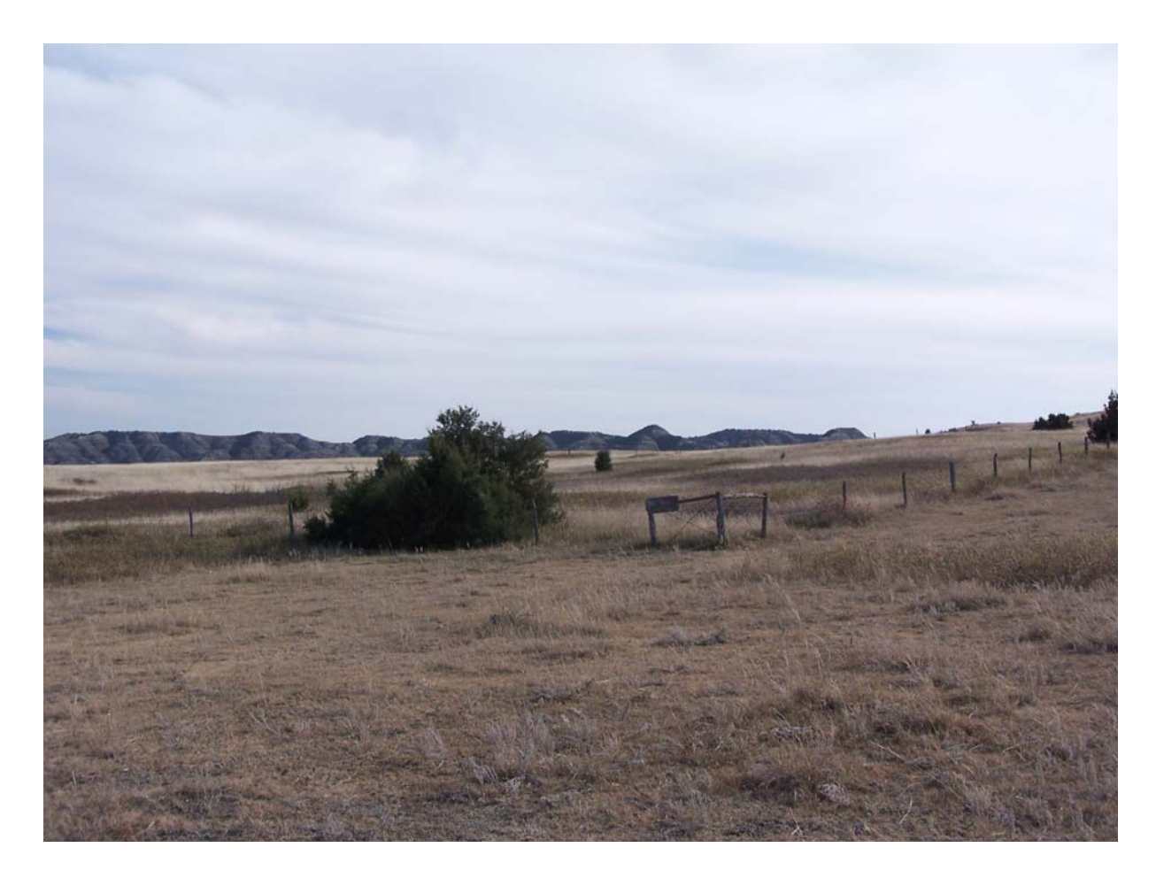
Figure 10. Shallow Ecological Site, exclosure with increased woody vegetation.