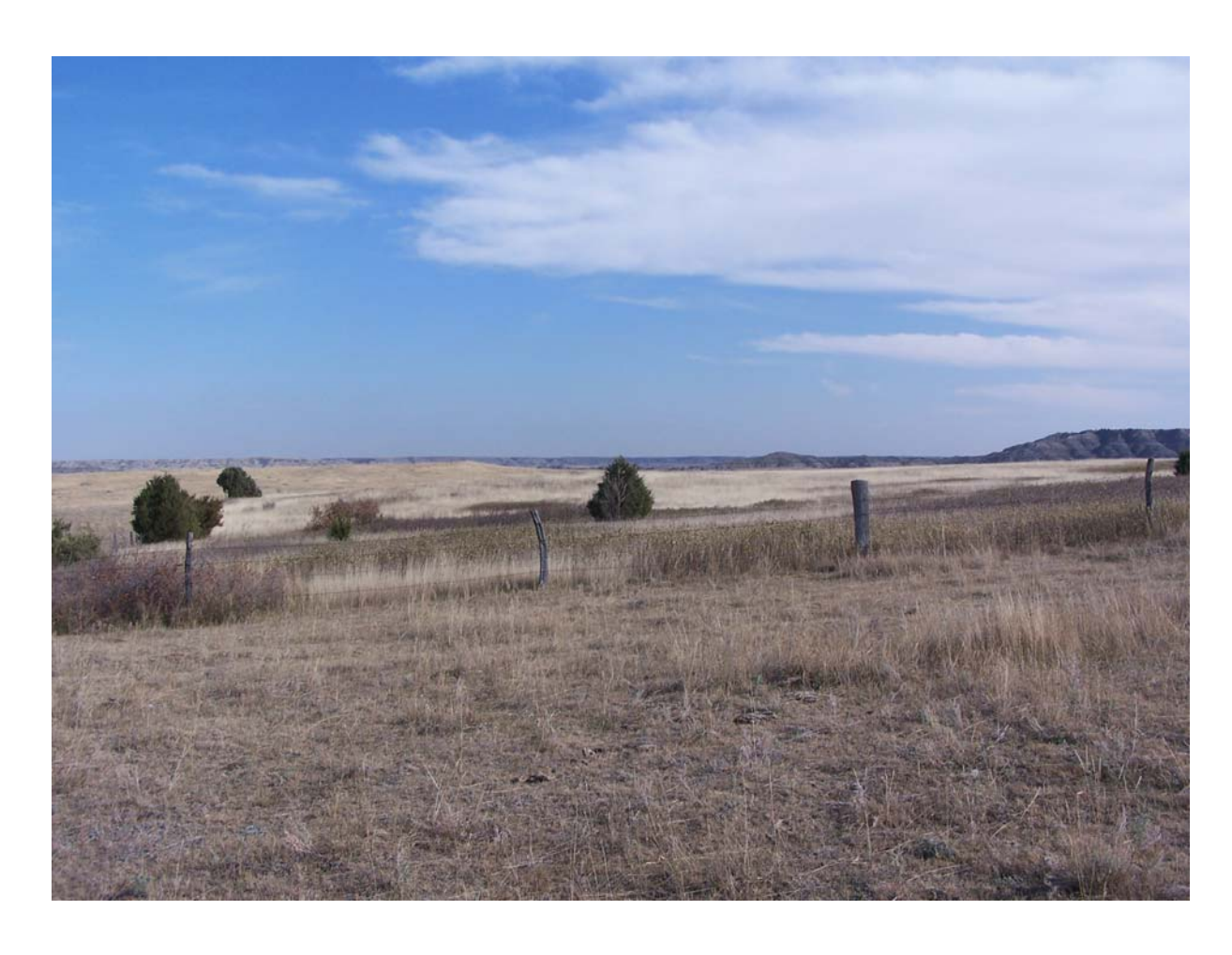
Figure 8. Shallow Ecological Site, located in Sec. 5, T 138 N, R 101 W, exclosure of 6.50 acres, built in 1937, looking East.