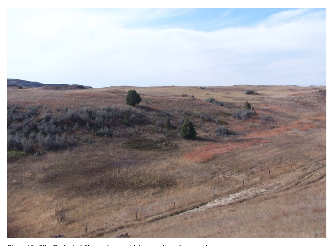
Figure 15. Silty Ecological Site, exclosure with increased woody vegetation.