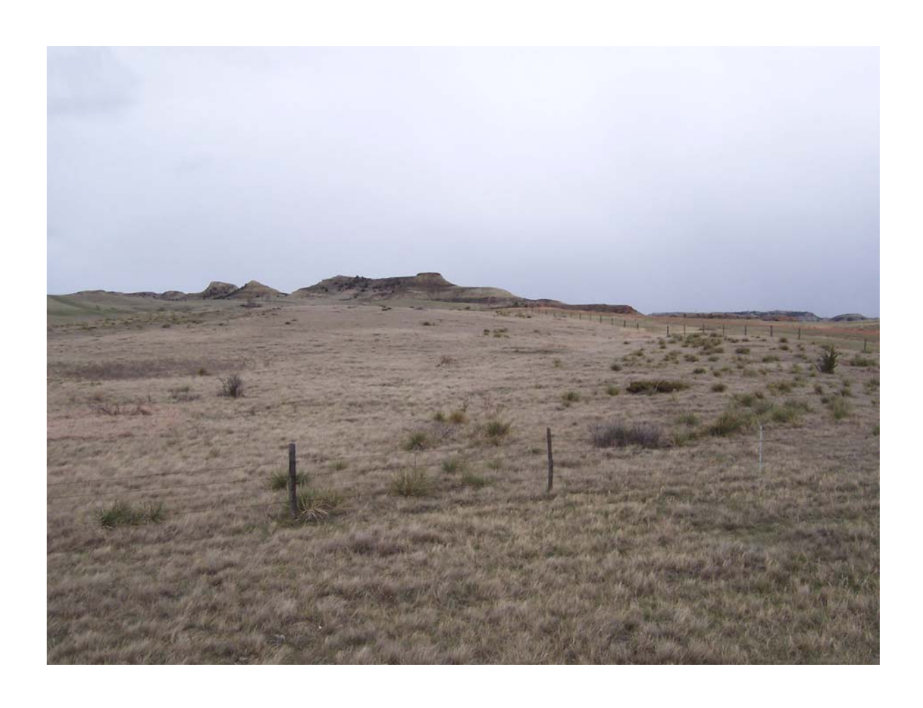
Figure 3. Sandy Ecological Site, located in Sec. 15, T 138 N, R 102 W, exclosure of 6.27 acres, built in 1937, looking East.