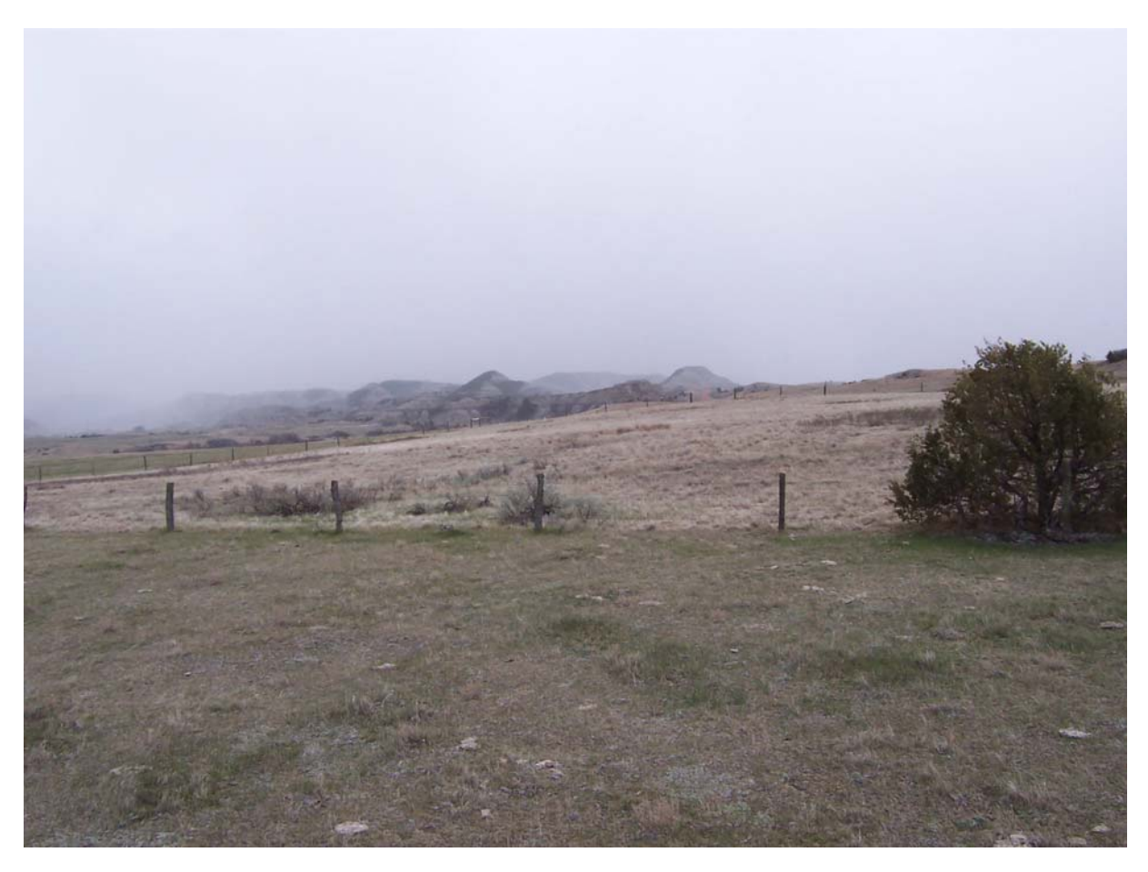
Figure 9. Shallow Ecological Site, located in Sec. 5, T 138 N, R 101 W, exclosure of 6.50 acres, built in 1937, looking South.