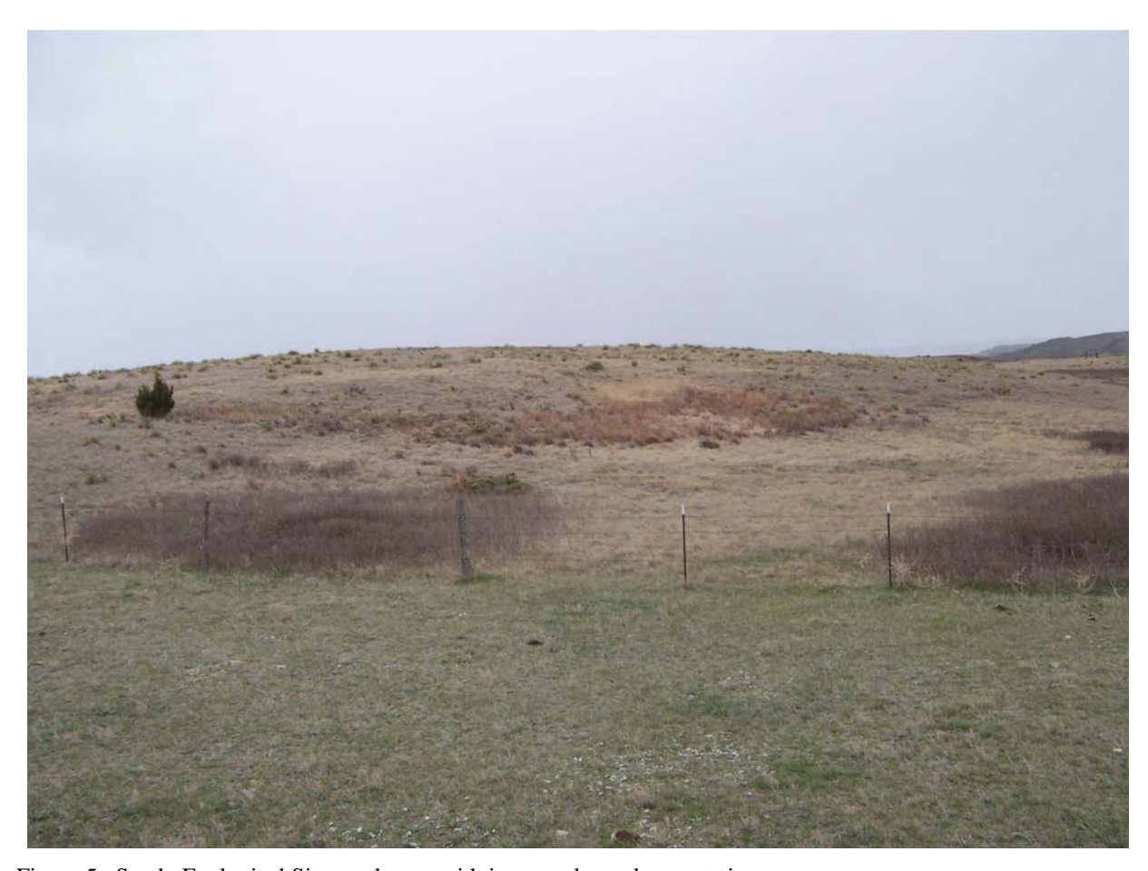
Figure 5. Sandy Ecological Site, exclosure with increased woody vegetation