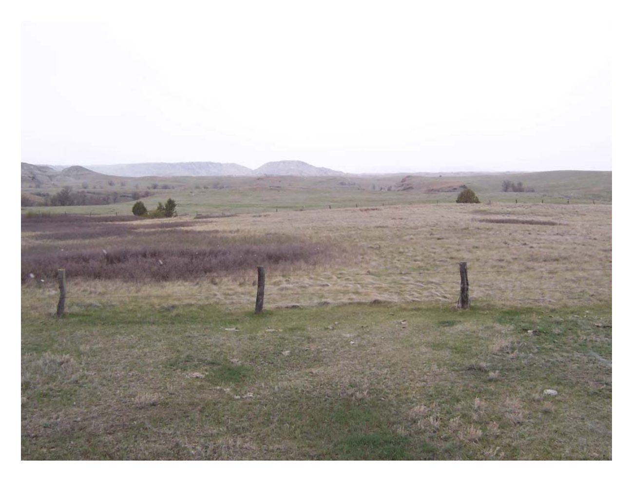
Figure 7. Shallow Ecological Site, located in Sec. 5, T 138 N, R 101 W, exclosure of 6.50 acres, built in 1937, looking North.