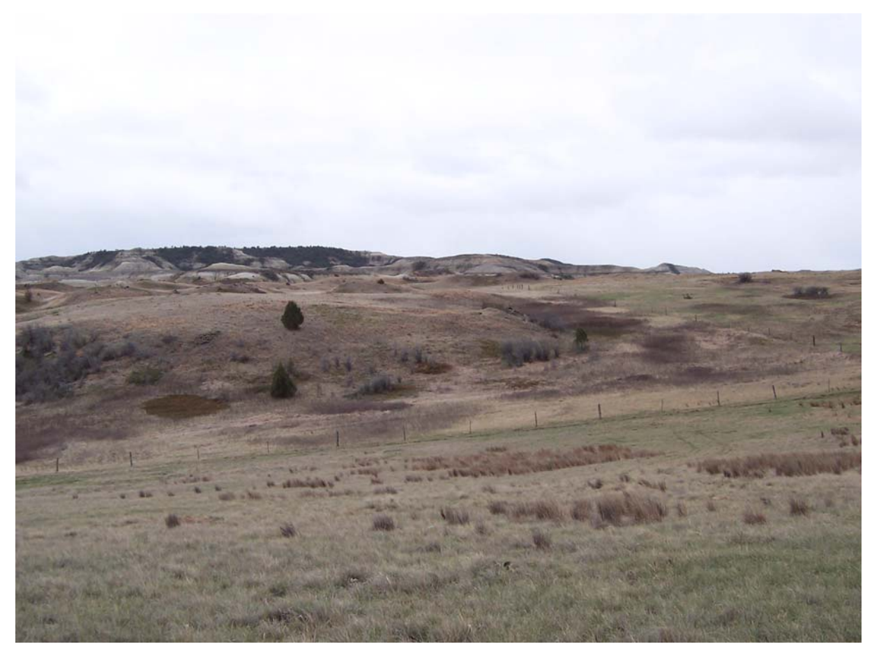
Figure 14. Silty Ecological Site, located in Sec. 3, T 138 N, R 101 W, exclosure of 14.10 acres, built in 1938, looking South.