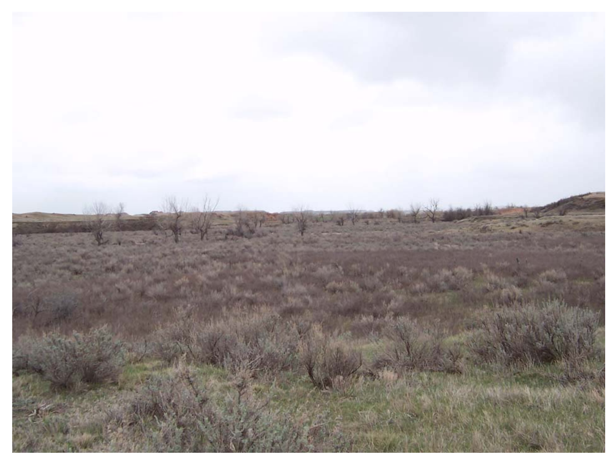
Figure 19. Overflow Ecological Site, located in Sec. 11, T 138 N, R 101 W, exclosure of 2.90 acres, built in 1937, looking South.