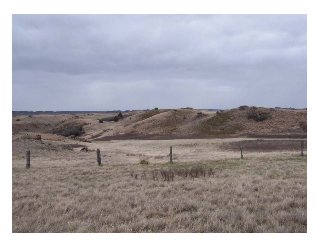
Figure 13. Silty Ecological Site, located in Sec. 3, T 138 N, R 101 W, exclosure of 14.10 acres, built in 1938, looking East.