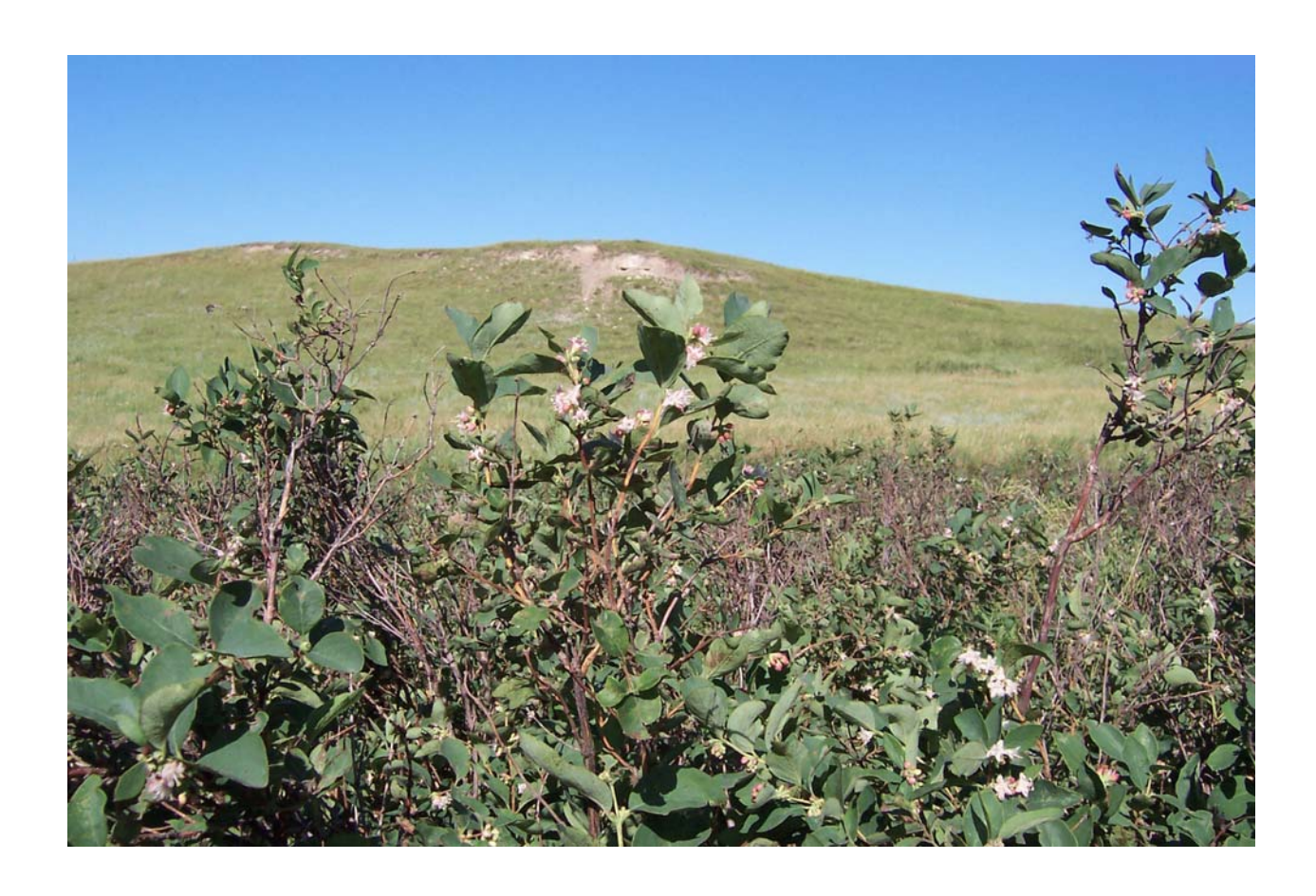
Fig. 3. Flowering western snowberry.