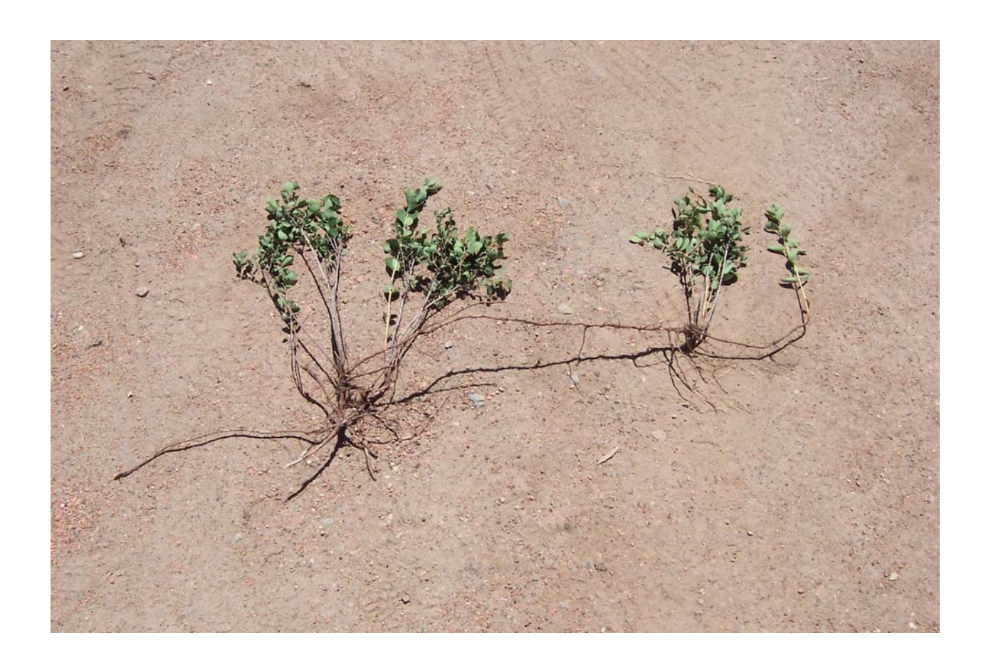
Fig. 1. Excavated western snowberry rhizomes and rhizome crowns with clusters of aerial stems.