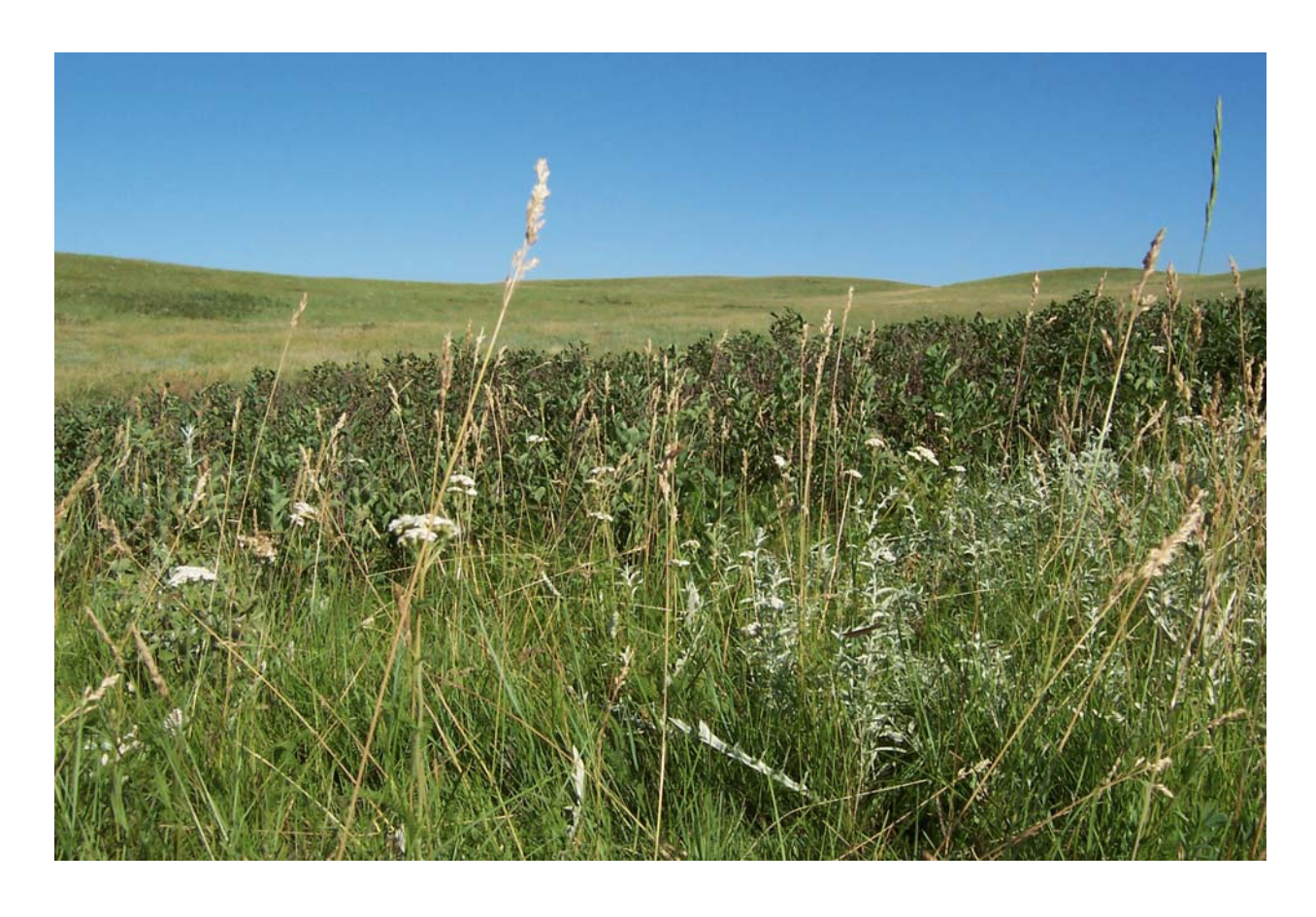
Fig. 2. Kentucky bluegrass associated with western snowberry colonies.