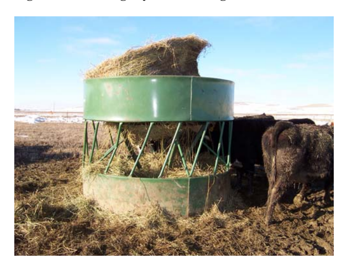
Figure 6. Poorly tied, loose oat-hay bale.

Figure 5. Dense tightly tied alfalfa-grass bale.