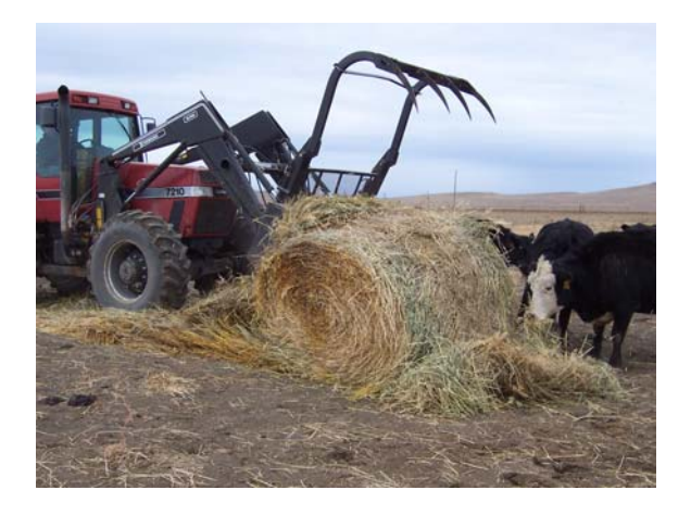
Figure 3. Bale Processor.