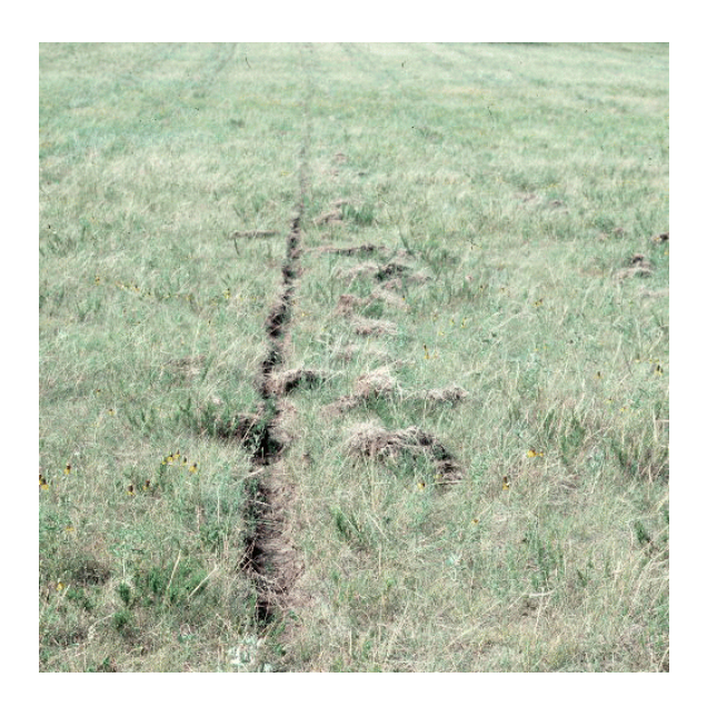
Fig. 7. Interseeded furrow, year one.