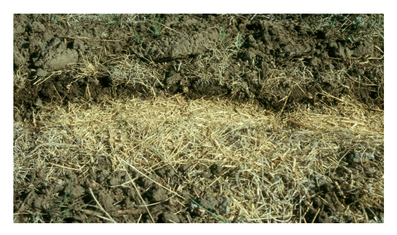
Fig. 16. Furrow mulched with chopped hay.