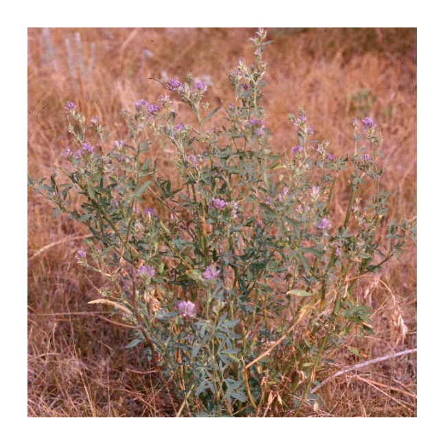
Fig. 10. Interseeded mature alfalfa plant.