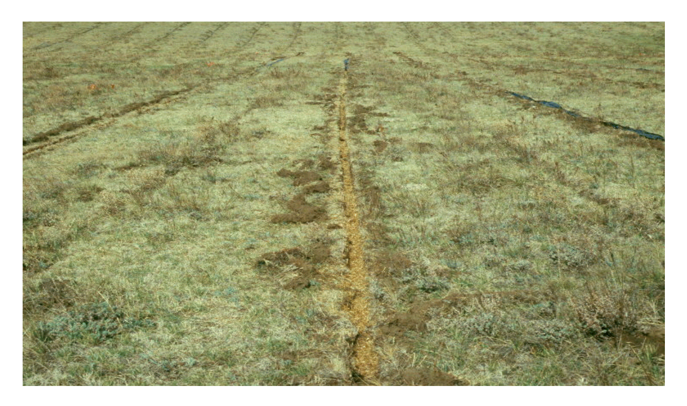
Fig. 17. Chopped oat straw furrow mulch.