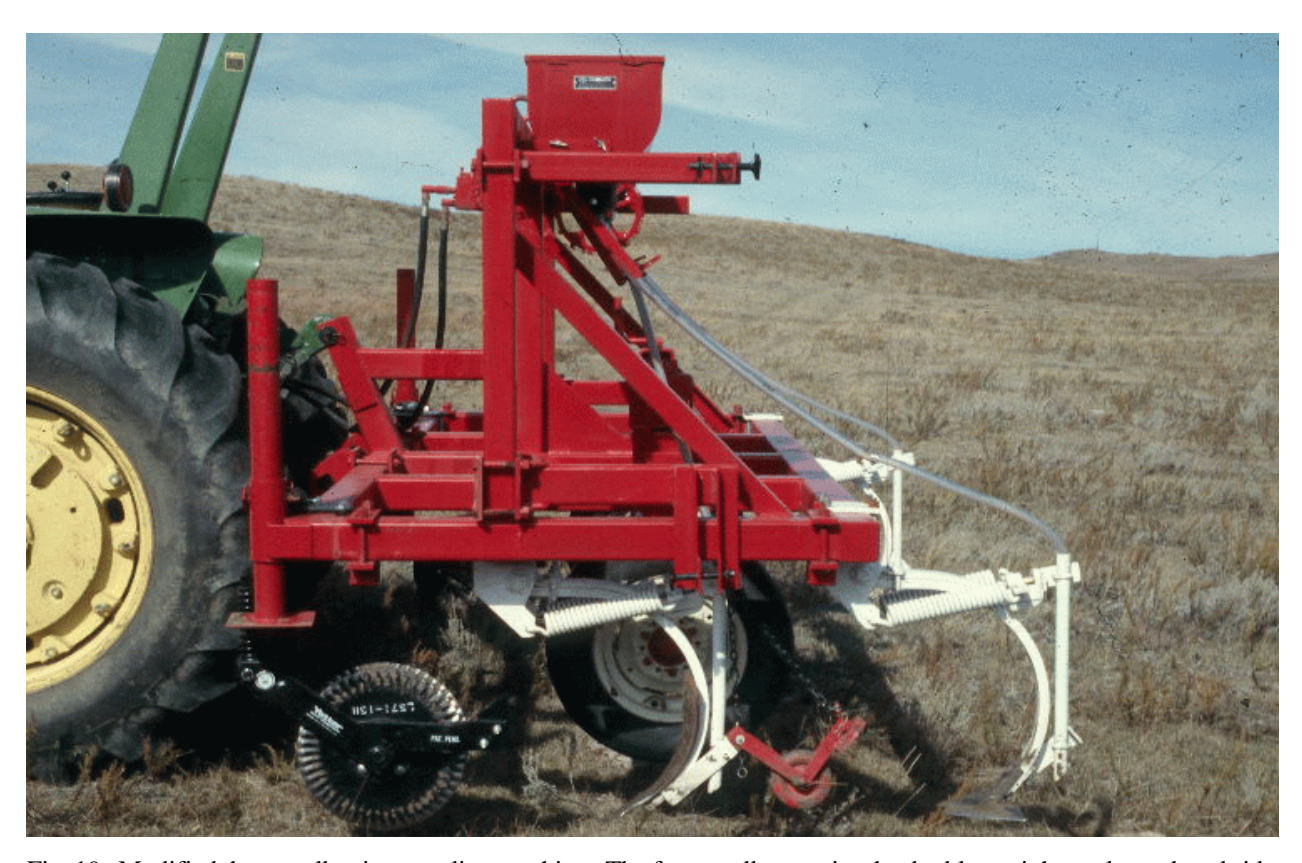
Fig. 19. Modified three toolbar interseeding machine. The front toolbar carries the double straight coulters placed side by side and three inches apart. The middle toolbar carries the three-inch twisted chisel plow shovel, the seed tube, and the pack wheel. The back toolbar carries the 12-inch cultivator sweep with the tip removed and the fertilizer tube.