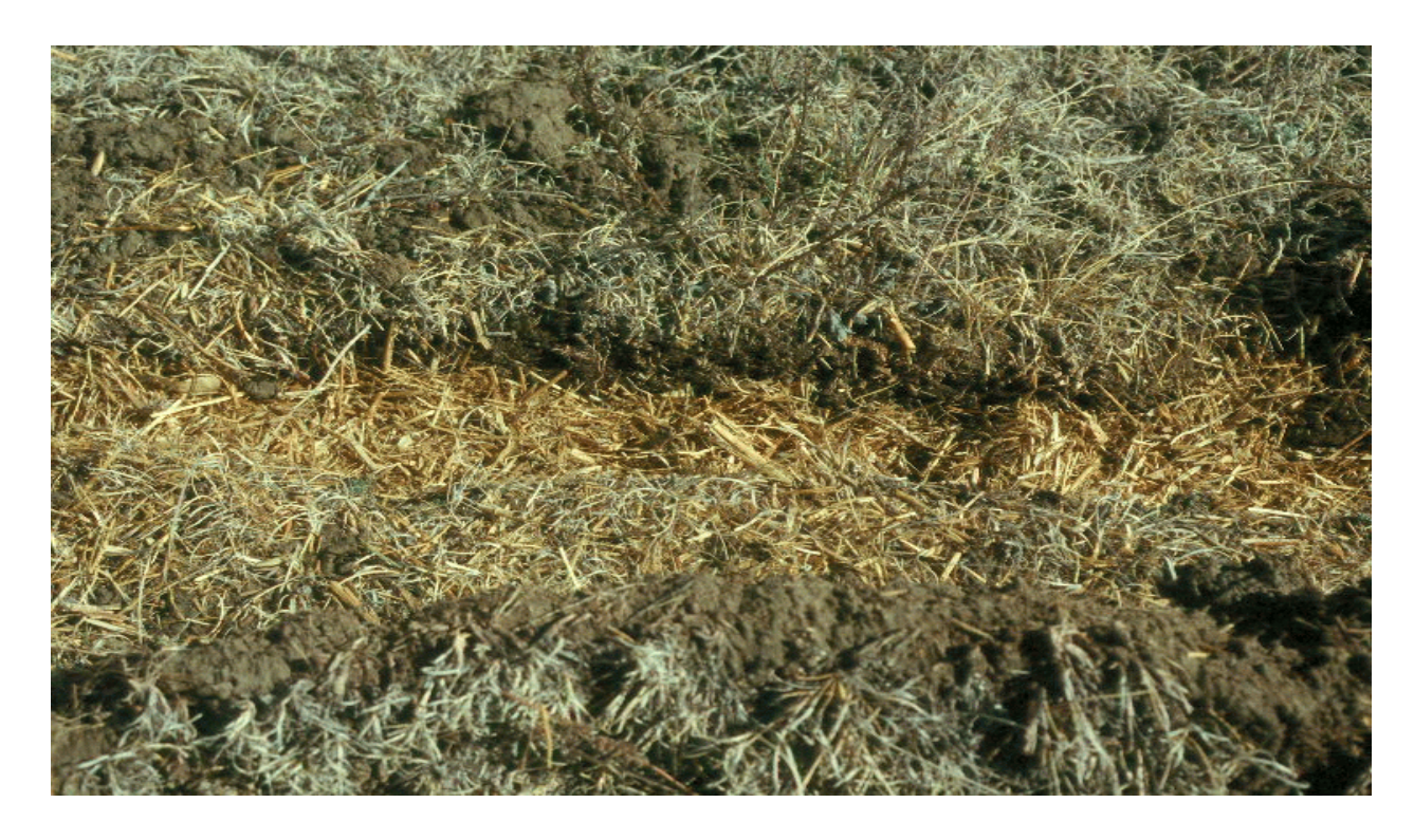
Fig. 18. Furrow mulched with chopped straw.