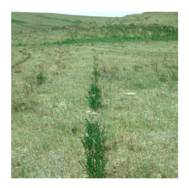
Fig. 9. Interseeded furrow, year three.