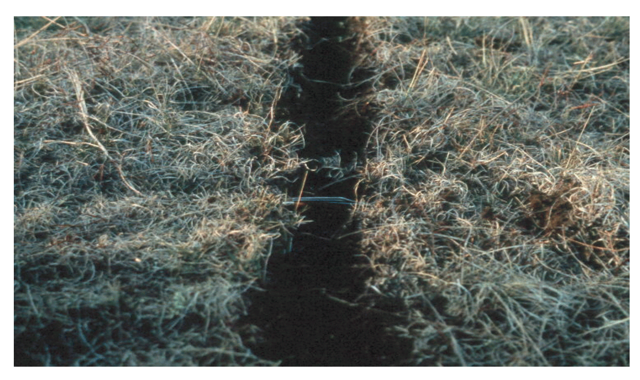
Fig. 2. Furrow made with two-inch straight spike chisel.