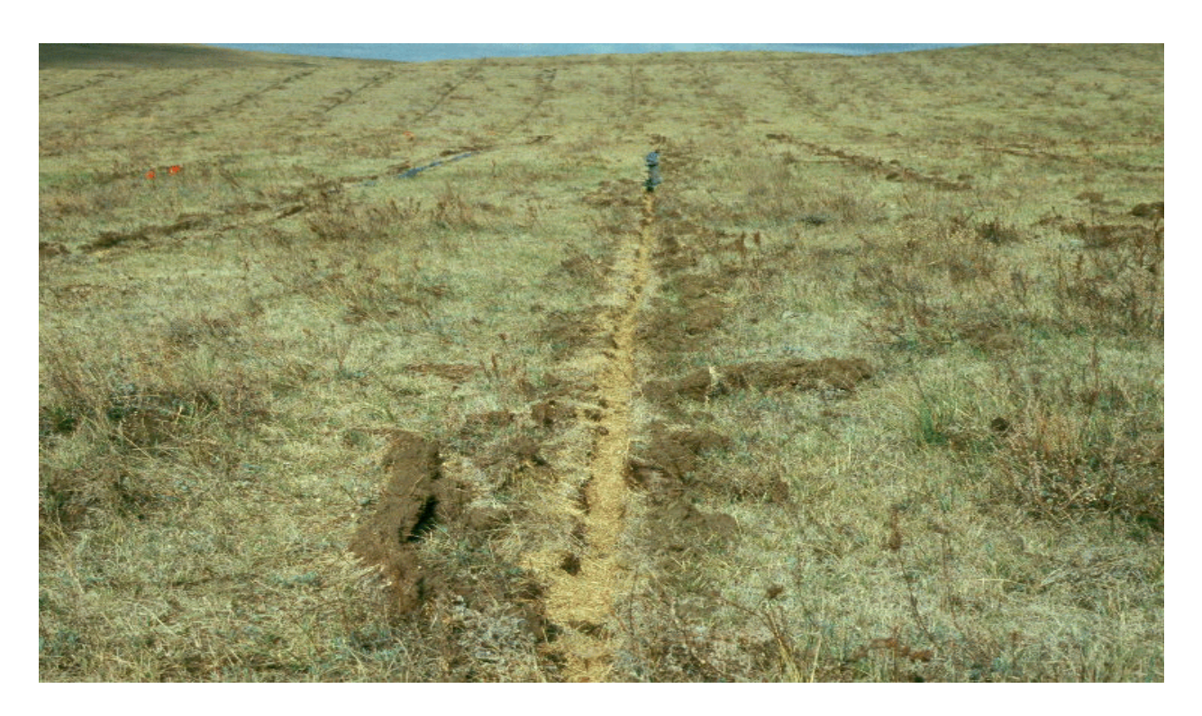
Fig. 15. Chopped crested wheatgrass hay furrow mulch.