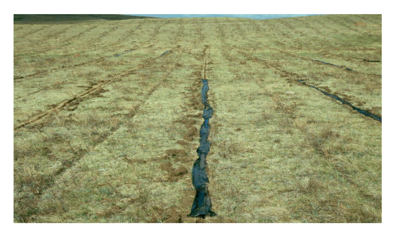
Fig. 13. Black plastic furrow mulch.