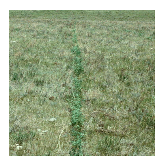
Fig. 8. Interseeded furrow, year two.