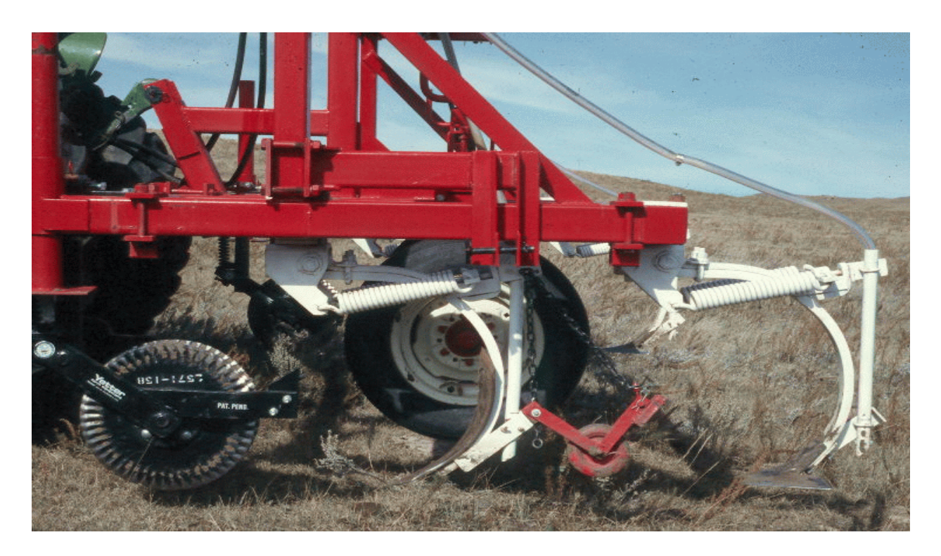
Fig. 11. Seedbed firmed with pack wheel.