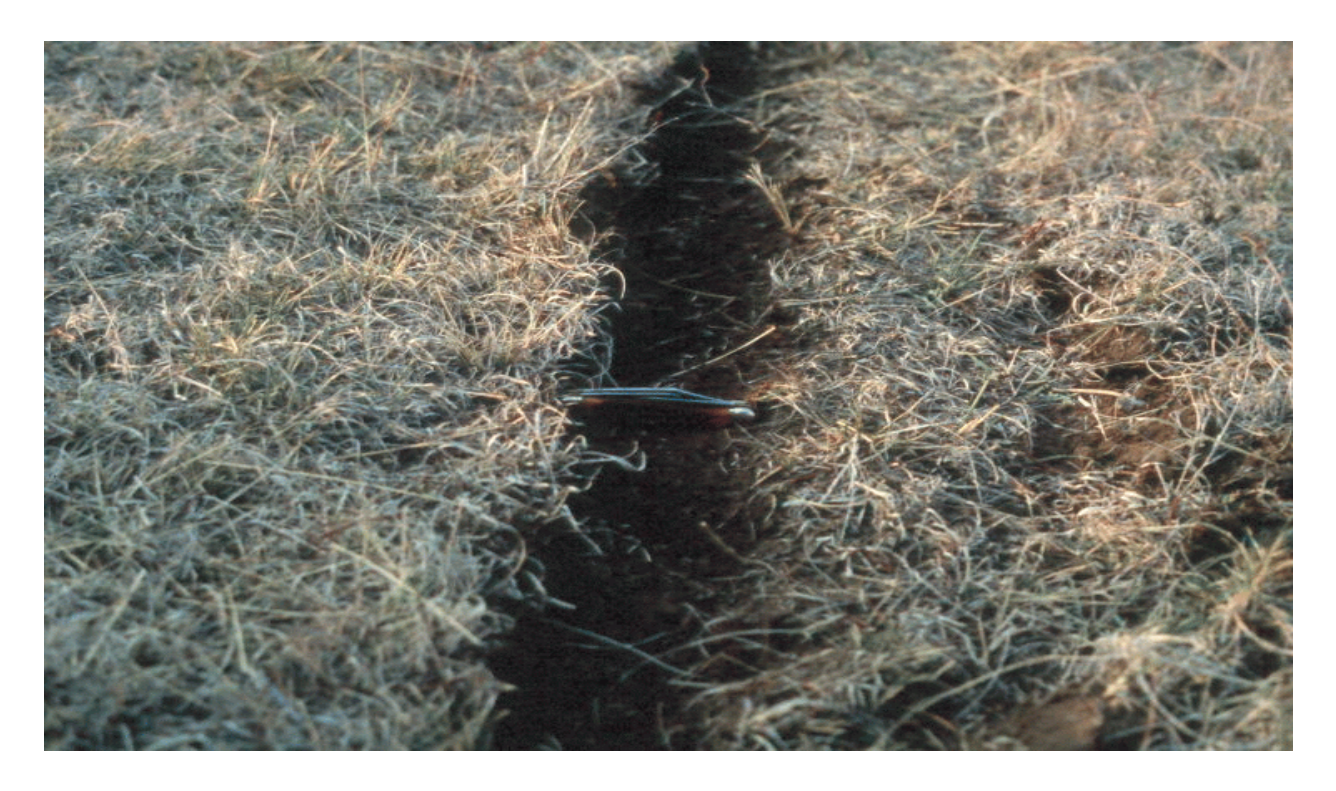
Fig. 6. Furrow made with four-inch twisted chisel plow shovel.