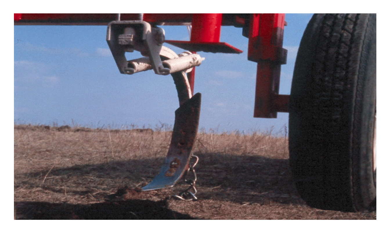
Fig. 5. Four-inch twisted chisel plow shovel.