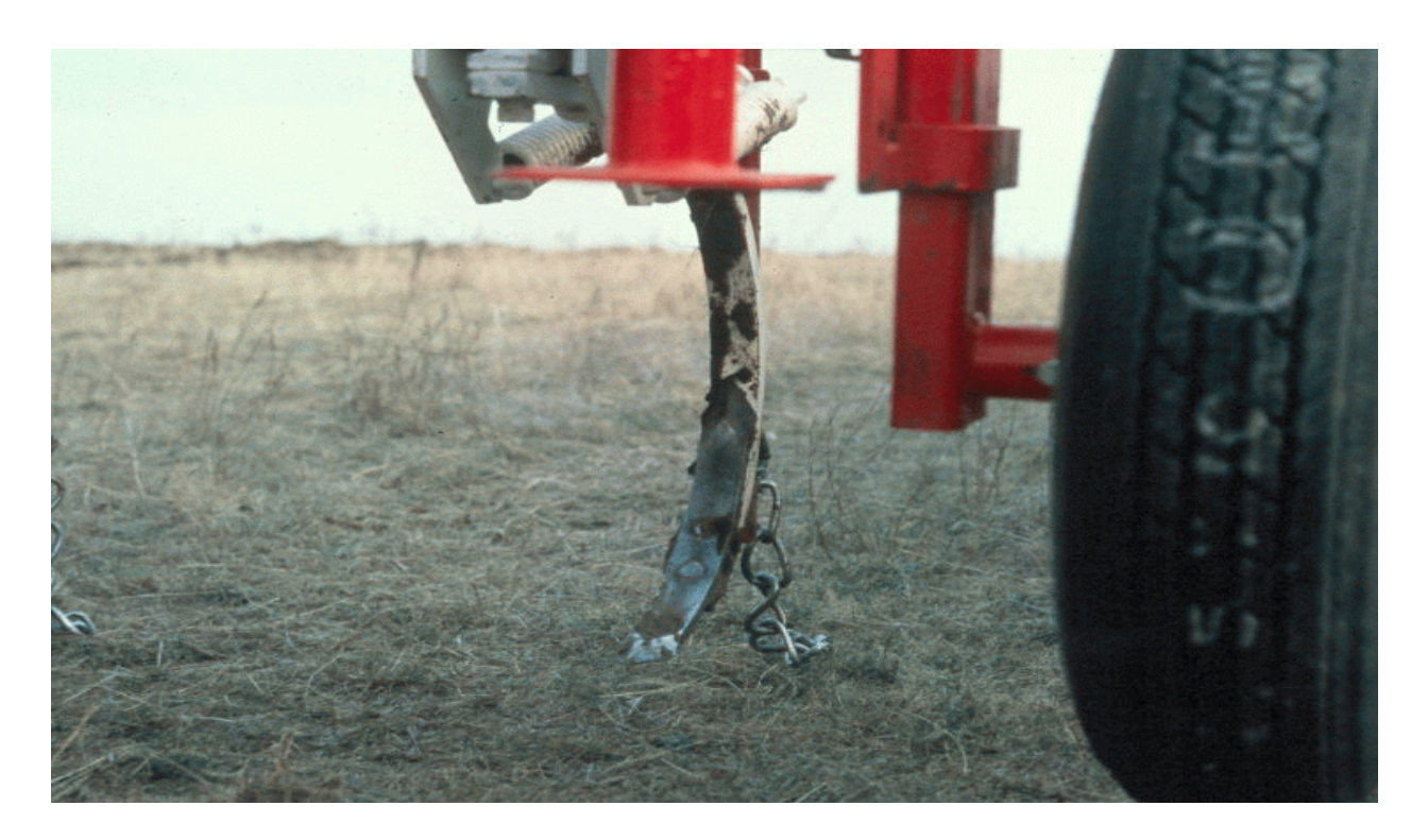
Fig. 1. Two-inch straight spike chisel.