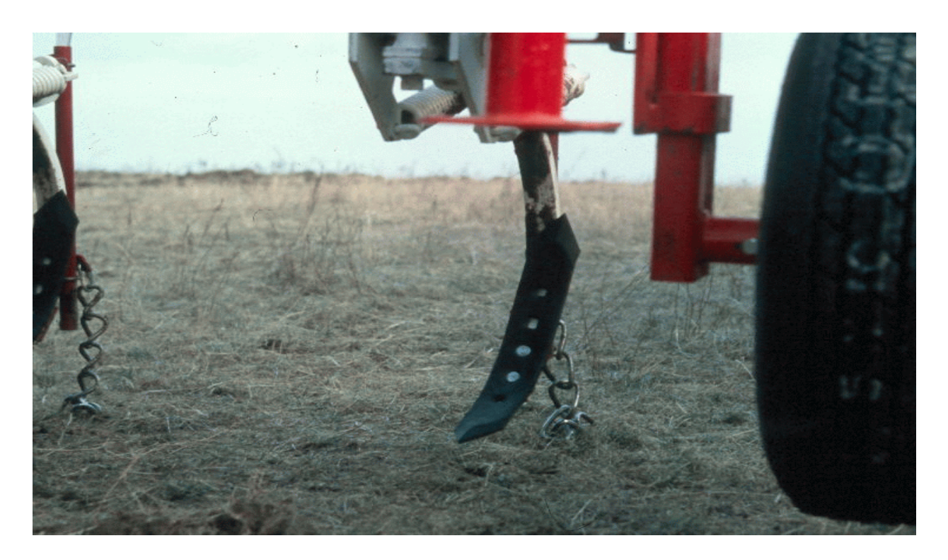
Fig. 3. Three-inch twisted chisel plow shovel.