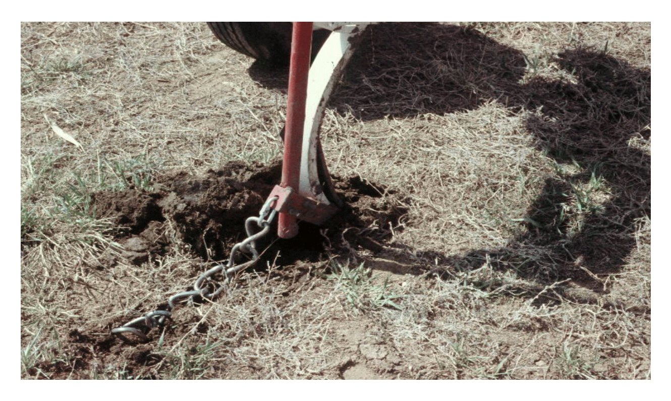
Fig. 12. Seedbed firmed with drag chain.