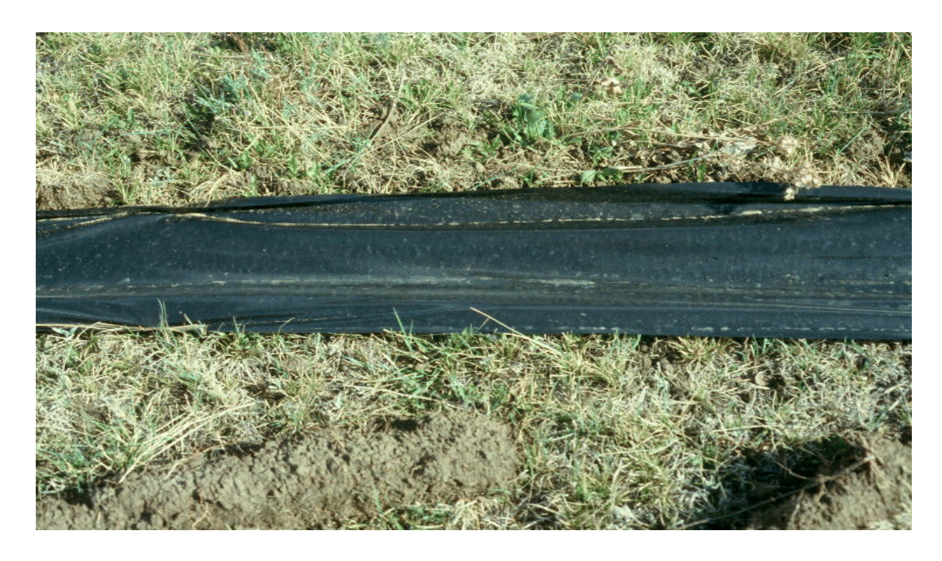
Fig. 14. Furrow mulched with black plastic.