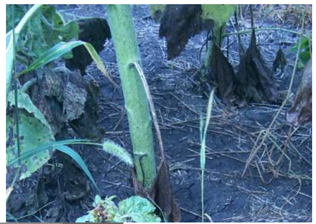
Figure 5. Downy mildew in sunflower field, Miles Hansen Farm, Bowman, ND, 2000.

open in browser PRO version Are you a developer? Try out the HTML to PDF API