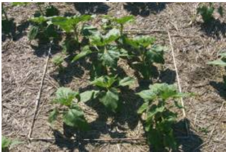
May 23 Planting Date - 24,000/acre