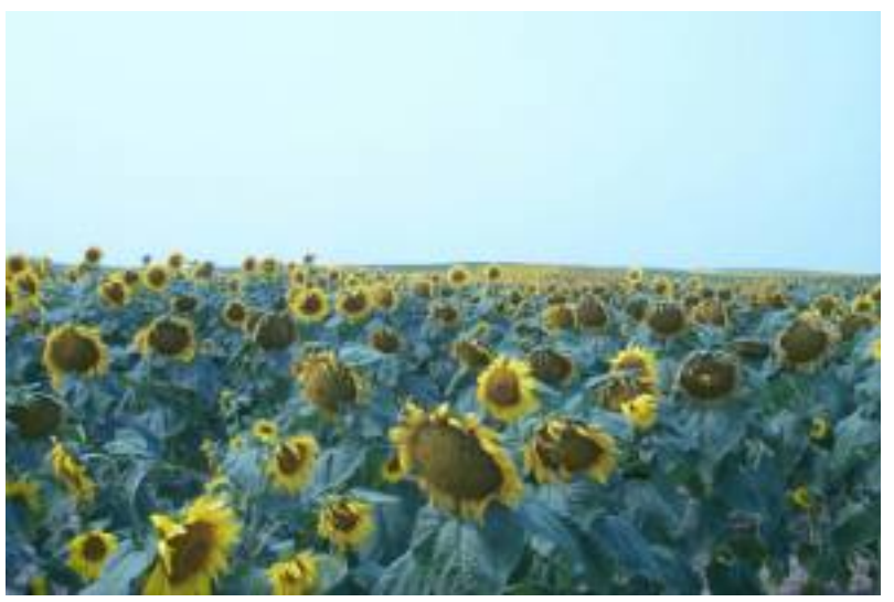
May 10 Planting Date - R6