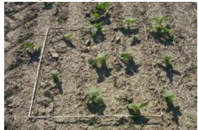
June 7 Planting Date - 22,500/acre

Figure 4. Stage of development for the four planting dates on August 10, 2000 on the Miles Hansen Farm, Bowman, ND.