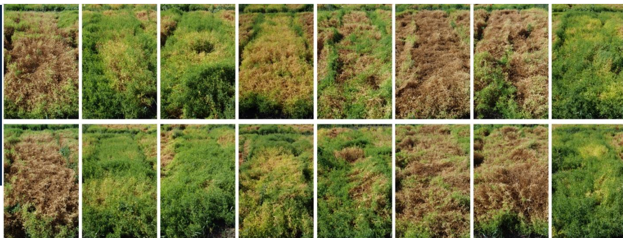
Non-treated check (A,B)

North Dakota State University Carrington Res. Extension Center