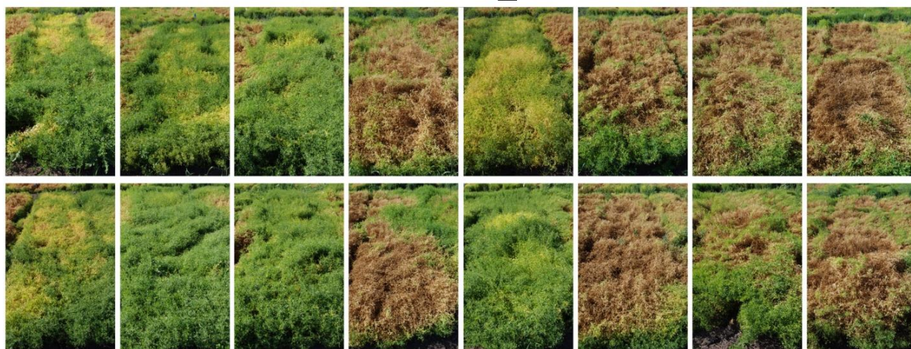
Priaxor 4 fl oz/ac (A,B)