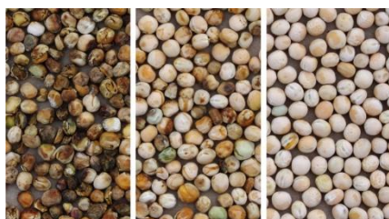
Seed discoloration: Seeds at the left and center were considered discolored.

Overall yields were severely reduced by a significant hail storm on July 24. The hail storm resulted in both mechanical damage and high levels of bacterial blight, which is not controlled by fungicides.