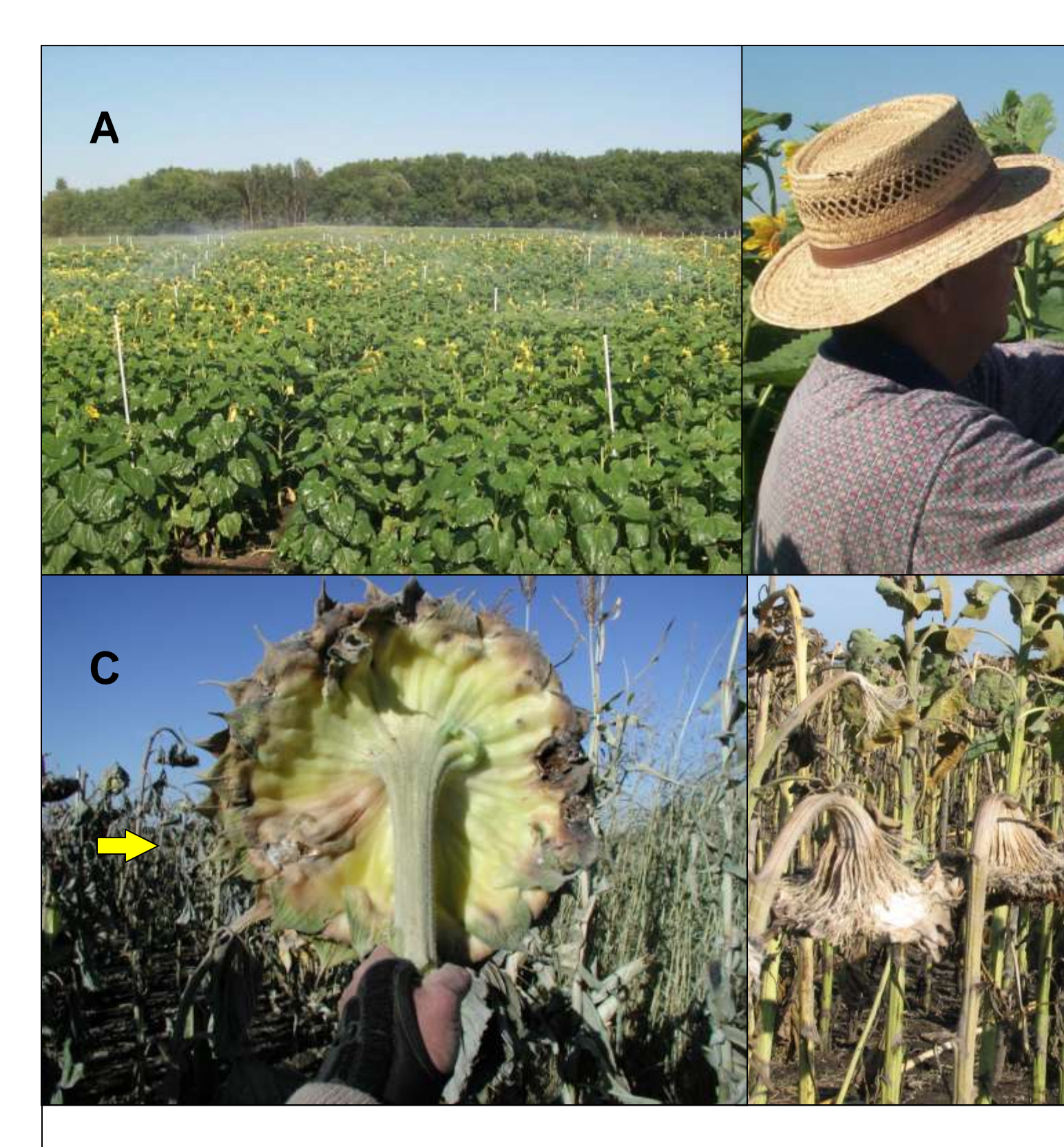
Figure 1. A= Mist irrigation system plot at Carringto ascospores. C= initial Sclerotinia infection two weel D= fully susceptible row with heads nearly disintegral.