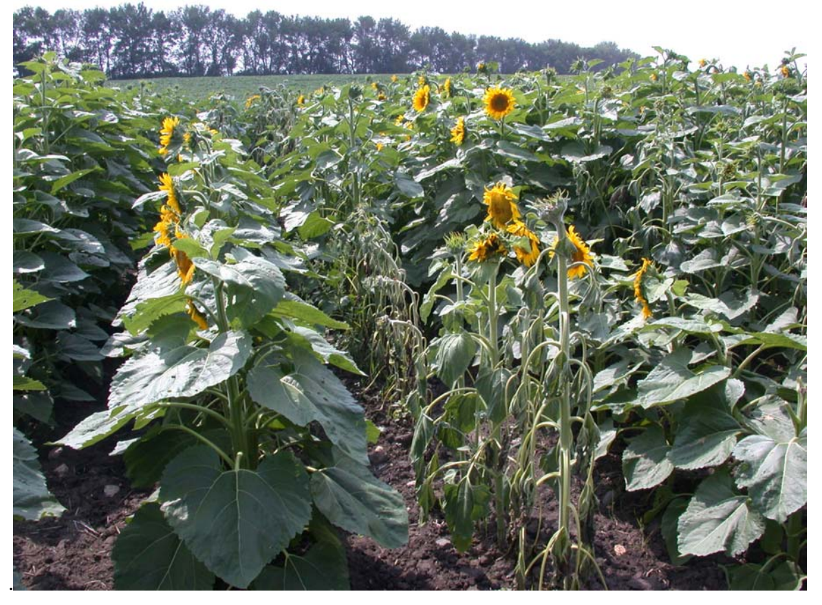
Figure 2. A comparison between an entry (left) highly resistant to stalk rot and a highly susceptible entry (right) in the inoculated trial at Carrington, ND.

The gradation in disease incidence from the most resistant to the most susceptible hybrids was continuous, as would be expected from a polygenically controlled quantitative trait, which precludes categorizing the entries into discrete groupings such as "resistant" or "susceptible." (Figure 2).