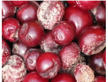
Damage seen at harvest.

Notes: In 2011, the fruit crop was a bit smaller than I had expected from the number of flowers. Our harvest, however, was decimated by a hail storm on July 24. Prior to harvest, we used gloves and picked up fallen or injured fruit. At harvest, we discarded many moldy cherries.