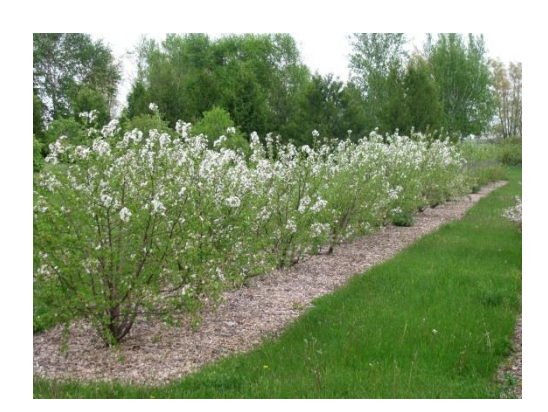
Carmine Jewel June 1, 2011

Flowering: We are seeing a phenomenon that is not unknown in the dwarf sour cherries. The barren branches (above) are caused by the previous years' fruit production when almost all the buds were reproductive and not many were vegetative. These areas will not become leafed or fruitful and should be pruned out. 'Crimson Passion' has shown a strong tendency toward this pattern and this creates a dilemma when pruning. It's obvious that these branches will have to be renewed – and yet the form I have created is so nice! 'Carmine Jewel', on the right, is not really showing barren branches as much as it is showing the protection that snow gives in winter. The lower half of both varieties bloomed first and then the unprotected upper halves bloomed afterward.