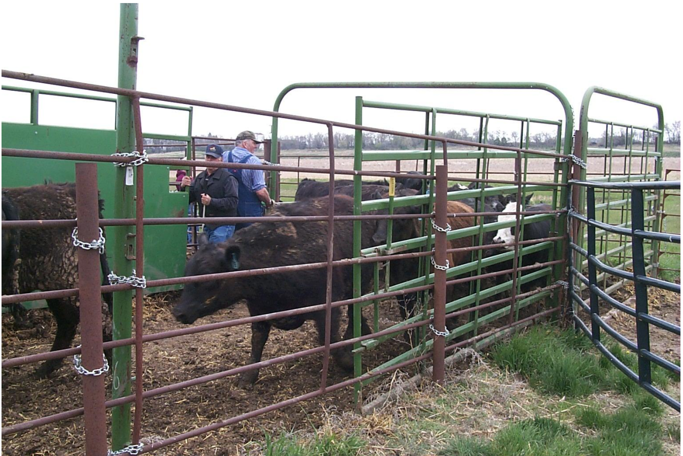
Finished steers loaded for market.

Factors influencing price of calves sold in midwinter (January) 2006 are shown in Table 2. Calves sold during this period had an average weight of 627 pounds.