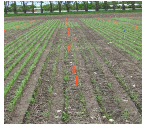
Figure 1. The effect of N-rates and ESN to urea blending ratios on wheat stand establishment

Applying fertilizer under the soil surface at planting saves time and eliminates the need for tillage for the sake of incorporating. This preserves moisture and residue. Putting the fertilizer directly in the seedbed with the planter has its own advantages over banding. Without the drag of additional equipment for banding, putting fertilizer down the tube saves fuel. It also decreases soil disturbance, thereby preserving moisture and residue even more. The challenge with this method is avoiding a substantial reduction in stand due to the damage that urea causes when it comes in close contact with the seed (Figure 1). Despite this challenge, there is substantial interest in using this method and some farmers have reported positive outcomes with it. Environmentally Smart Nitrogen (ESN) is a slow-release nitrogen fertilizer product made of polymer-coated urea granules. It has been shown to be a good alternative to uncoated urea when it comes to in-furrow N application. The safety of urea and ESN application was found to be affected by soil type, width of seedbed and the width of rows. Current guidelines suggest that ESN can be applied at three times the safe rate of urea for a given crop and soil type. For a loam soil that would mean up to 30 lbs N as urea with the seed and up to 90 lbs N as ESN.