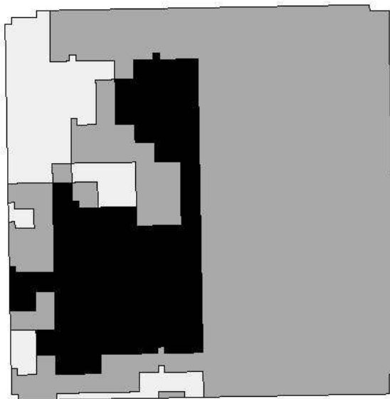
Map 1. N prescription map: black = 90 lb, grey = 60, and white = 30 lb N/acre.

In 2006, urea was preplant applied at variable rates to one-half of the irrigated wheat field, while one N rate was applied to the other half of the field. The N rates were based on a fall 2005 composite soil test, 40 lb/acre N soil credit for the 2005 soybean crop, and a base yield goal of 56 bu/A. The 'check' half of the field received 60 lb N/acre while the variable rate half received 30, 60, or 90 lb N/acre. The N rate prescription map (map 1) was generated with the SMS (AgLeader Technology) computer program using 2003-05 yield data. The urea was custom applied by Mainline Agronomy, Eldridge. After harvest, a profit/loss map (map 2) was generated to compare the profitability of the study. Conclusions cannot be made on this first year of data.