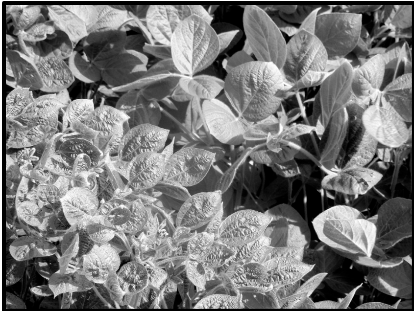
Two Liberty Link soybean varieties. The variety on the left was more susceptible to dicamba than the one on the right.