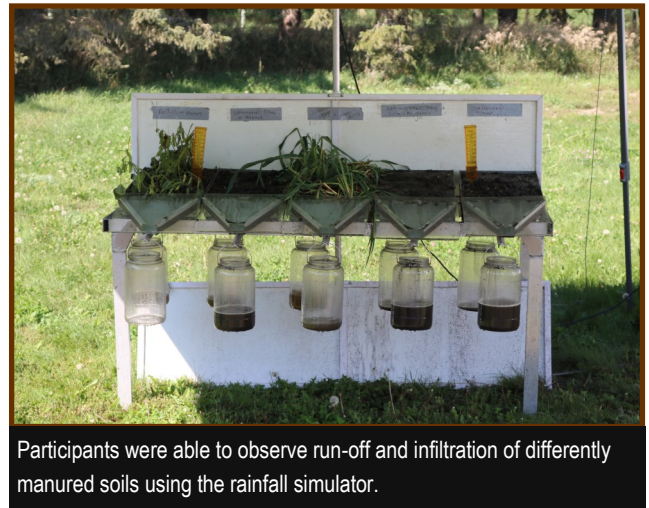
Participants were able to observe run-off and infiltration of differently manured soils using the rainfall simulator.

Participants loaded the wagons for a final time to visit locations around the CREC. A month prior, Berg buried men's undergarments around the station. Participants had the opportunity to excavate the undergarments and evaluate microbial activity. After collecting the drawers, Berg displayed each pair to be compared to one another. Likely the highlight of the afternoon for all the participants, observations of the cotton material or lack thereof were shared.