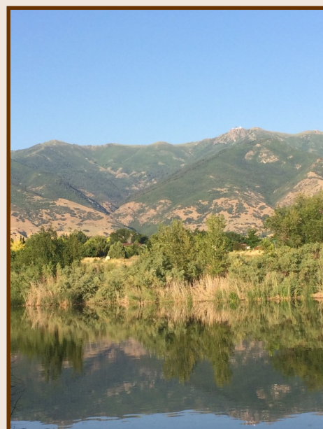
NACAA participants had a little time for sight-seeing while they visited Utah.