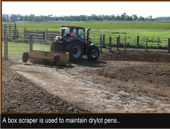
A box scraper is used to maintain drylot pens..

Nutrient Management Day was held Tuesday, August 29 th at the NDSU Carrington REC. The day began with a great start as early arrivers asked in-depth questions relating to their operations. Participants were welcomed to the Carrington REC at 10 a.m. and shortly thereafter loaded the wagon to make way to the livestock unit.