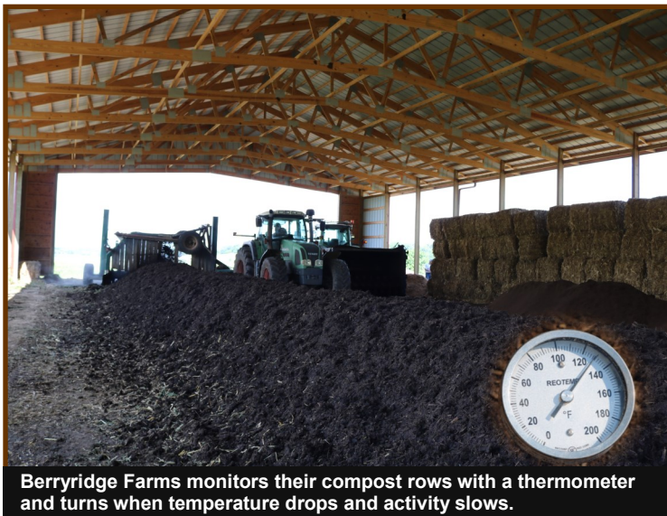
Berryridge Farms monitors their compost rows with a thermometer and turns when temperature drops and activity slows.

As we finish summer's work and roll into fall, let's think of it as a time to reset our plans for the next four months and do the best with what we have despite our current conditions. —Mary