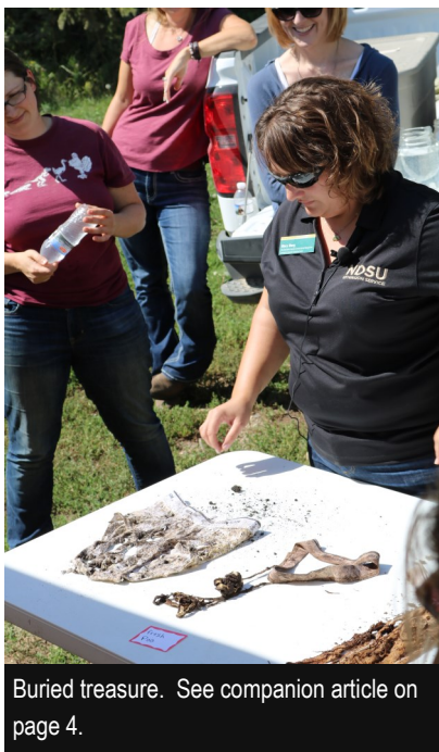
Buried treasure. See companion article on page 4.

volume reduction of compost materials. Schroeder provided a compost turner demonstration. The speed of the tractor (creeper gear) and moisture of the compost row was addressed during the demonstration.