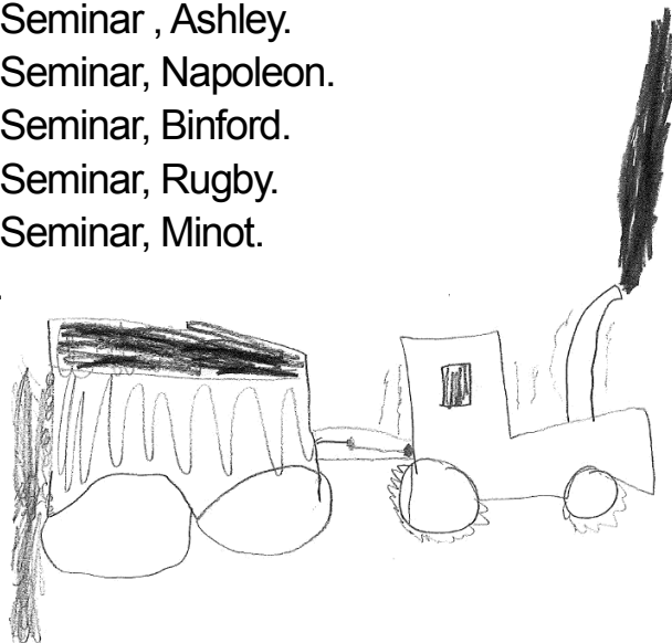
Student sketch depicts their connection to the soil.