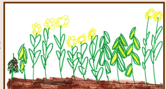
As part of "Kids, Compost, Crops, and Consumption," students were asked to create a sketch depicting their connection to soil.

Weinmann - honored in the Program Promotional Piece category for his leadership and collaboration with Fargo Cass Public Health in designing and planting a successful containerized community vegetable garden.