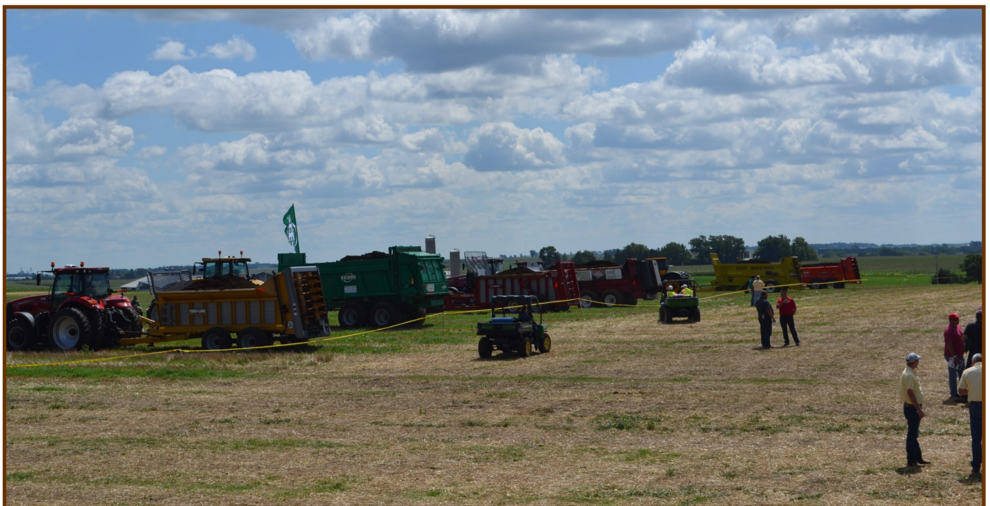
Various brands of manure spreaders were featured at the North American Manure Expo in Arlington, Wisconsin.

This method works well for solid manure applications.