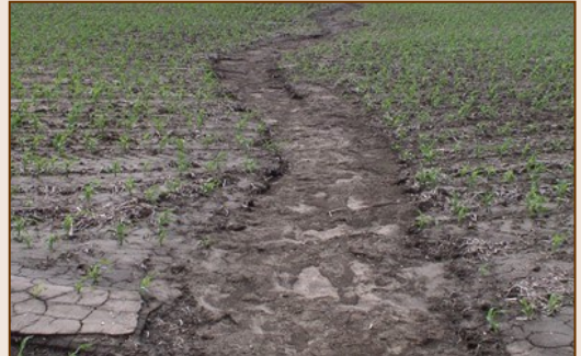
Figure 1. Can manure be part of the solution for the erosion in this photo?