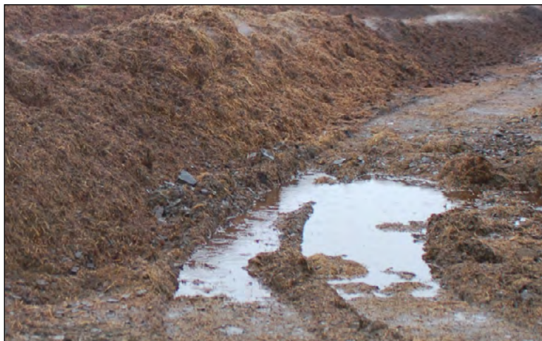
Saturated compost piles generate leachate, a threat to water quality.

The best use of collected leachate is to moisten an actively composting pile early enough in the process to meet PFRP. Alternatively, collected leachate can be applied to cropland requiring water and nutrients. Determine application rates according to the nutrient content of the leachate and the nutrient requirements of the crop.