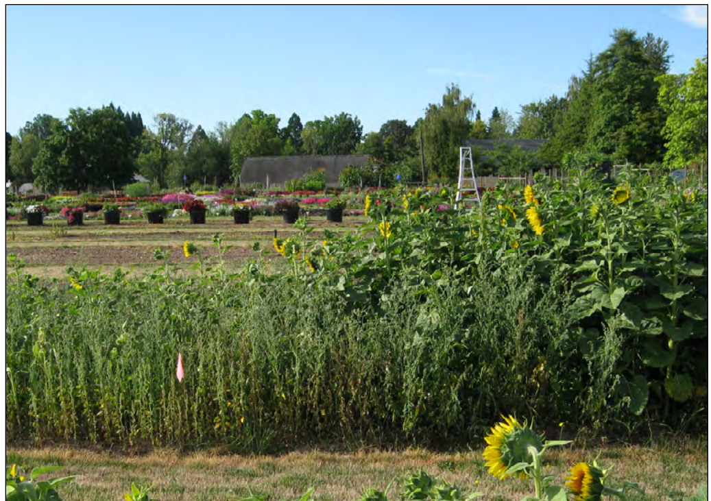
Compost can improve soil quality and plant growth. Sunflowers in compost-amended soil (right) vs. no compost (left).

The Oregon Department of Environmental Quality (DEQ) revised its composting regulations in 2009. This publication is intended to assist farmers who are regulated by DEQ rules to