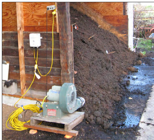
Blowers can be plumbed to push air through the pile, pull air from the pile, or alternate air flow direction.