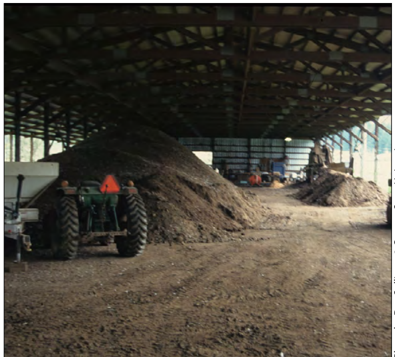
Roofed composting area

When you choose your site, be a good neighbor and reduce the potential for