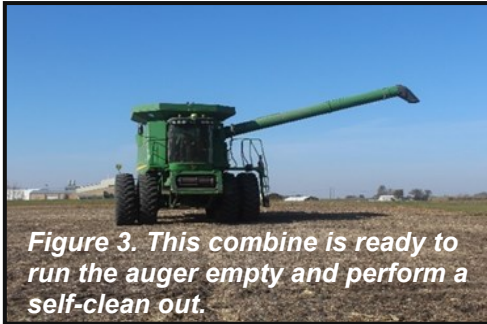
Figure 3. This combine is ready to run the auger empty and perform a self-clean out.

When preparing to conduct a clean-out of a combine, personal protective equipment should be worn. PPE necessary for this clean-out includes gloves, protective eyewear, a dust mask with at least an N95 rating, and hearing protection.