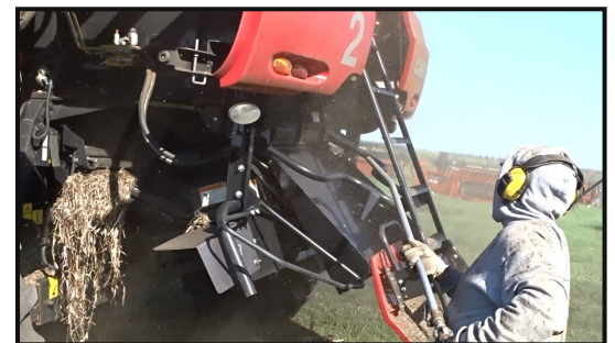
Figure 6 (Right). The final step in the clean-out process is to remove biomaterial left on the exterior of the combine, including the straw spreader.