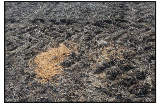
Figure 1. Material removed from clean grain elevator and tailings elevator when initially opened.

Combines are one of the largest and most impressive machines on a farm. These large machines effectively remove crops from fields and separate grain from other material to be spread back in the field. Following harvest of an individual field, combines retain significant material. As much as 150 pounds of biomaterial is retained, including chaff, grain, and weed seed. This material may remain in tight spaces within the machine or in obvious places, such as the gathering head and grain tank.