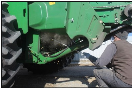
Figure 5 (Left). A final clean-out of the rock trap with a leaf blower or air compressor.