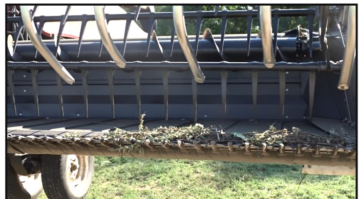
Figure 2. Plant material caught in the sickle sections of the cutting platform.