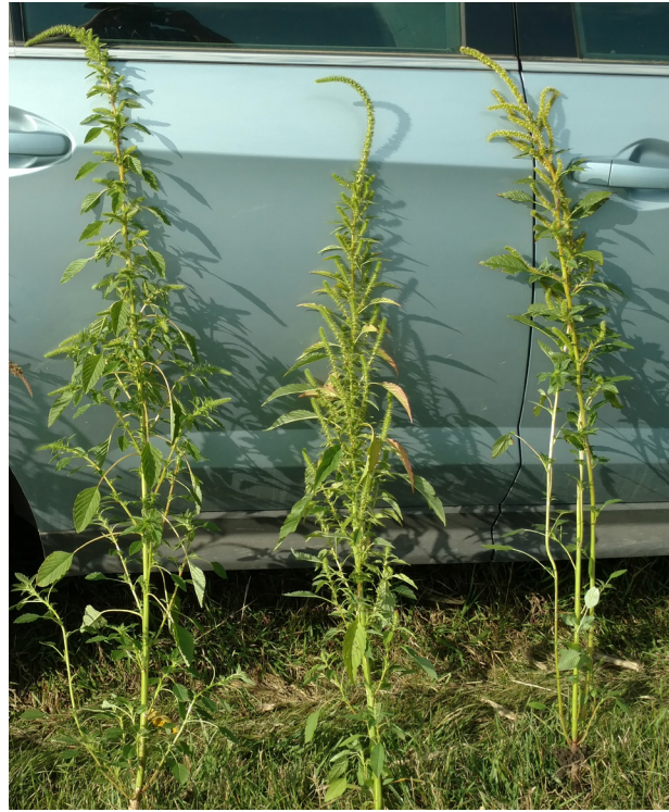
Palmer amaranth plants.