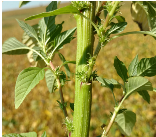
Female Palmer amaranth with spiny bracts (B. Jenks, NDSU)