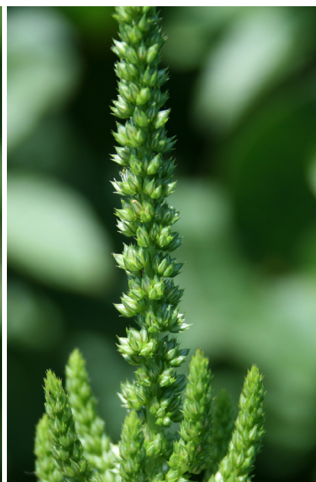
Waterhemp female seed head on left, male head on right.