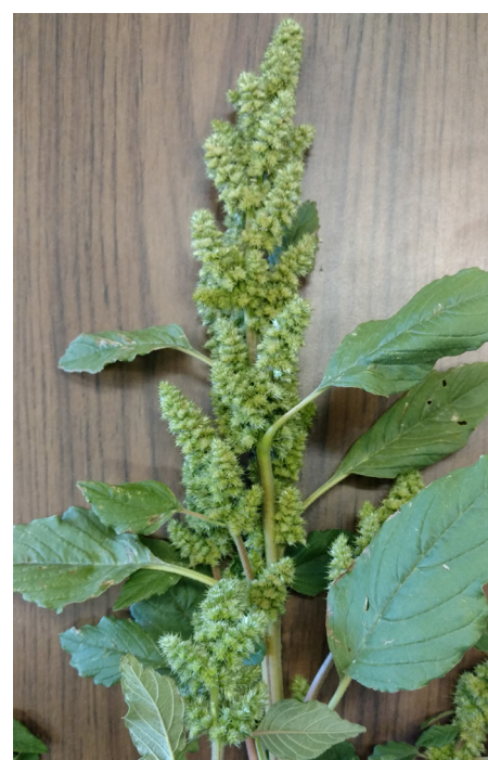
Redroot pigweed seed head.