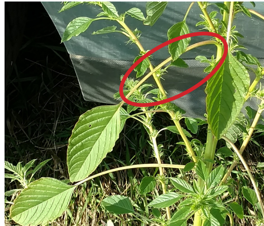
Palmer amaranth petioles are longer than the leaf blade (B. Jenks, NDSU)