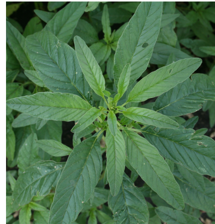
Waterhemp has long, narrow leaves.