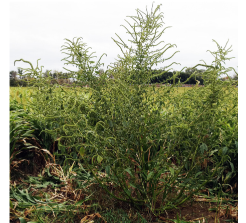
Palmer amaranth.