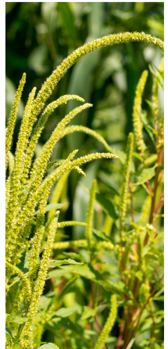
Palmer with long terminal seed head.