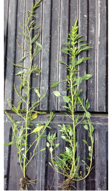
Palmer amaranth (right), waterhemp (left).