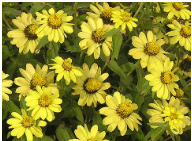
Zinnia marylandica 'Zahara Yellow'