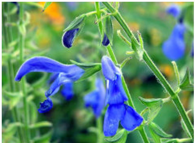
Salvia patens 'Blue Angel'