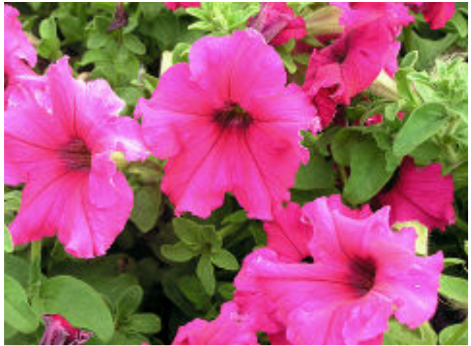
Petunia × hybrida (Grandiflora) 'Supercascade Rose'