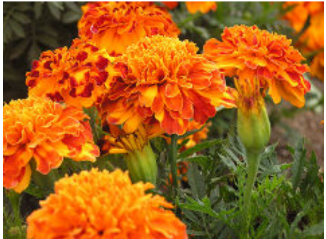
Tagetes patula (French marigold) 'Bonanza Bolero'