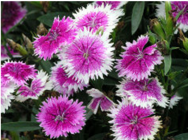
Dianthus chinensis 'Telstar Mix'