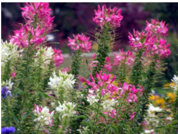
Cleome hasslerana (Spider Flower) 'Sparkler Mix'