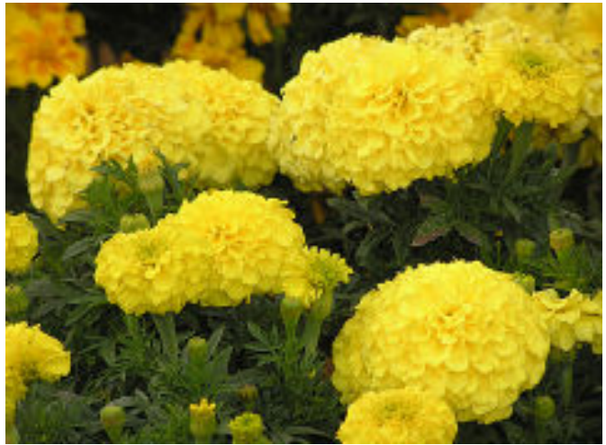
Tagetes erecta (African marigold) 'Antigua Yellow'