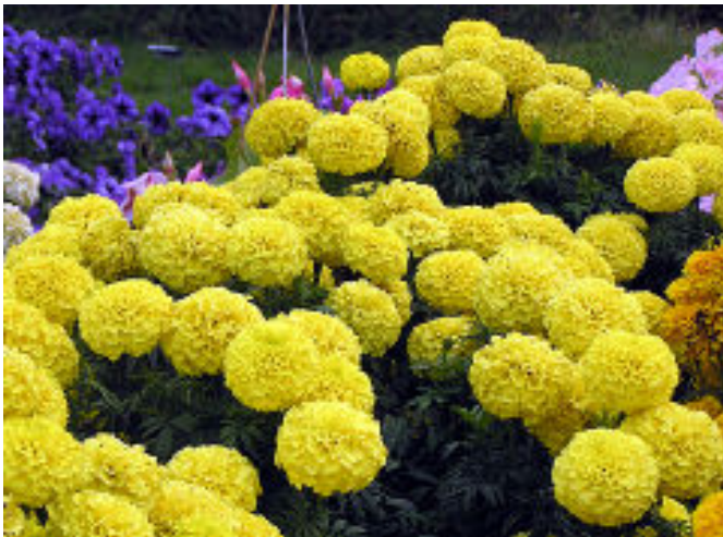
Tagetes erecta (African marigold) 'First Lady'