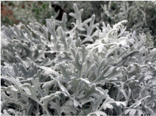
Senecio cineraria (Dusty Miller) 'Silverdust'