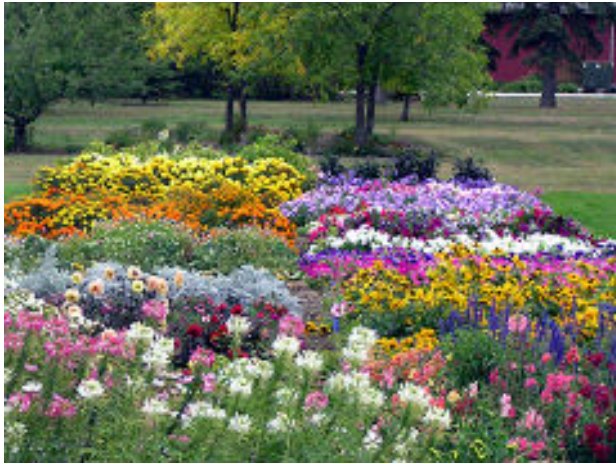
Annual flower trial bed