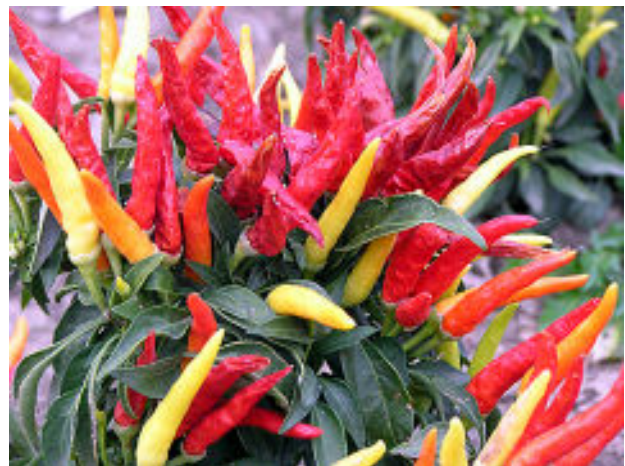
Capsicum annuum 'Chilly Chili'