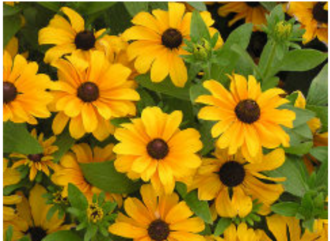
Rudbeckia hirta 'Tiger Eye Gold'