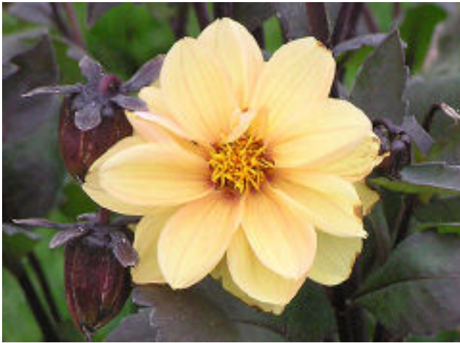
Dahlia pinnata 'Phantom of the Opera'