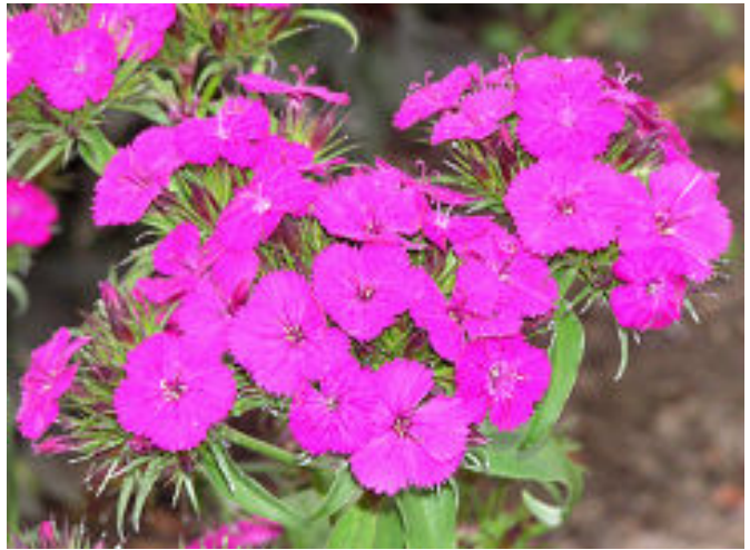
Dianthus barbatus 'Amazon Neon Purple'