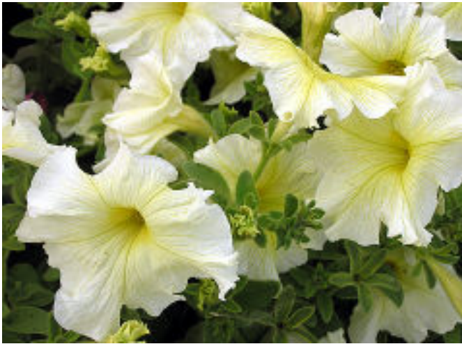
Petunia × hybrida (Grandiflora) 'Prism Sunshine'