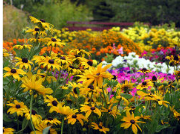
Annual flower trial bed ('Indian Summer' rudbeckia in foreground)