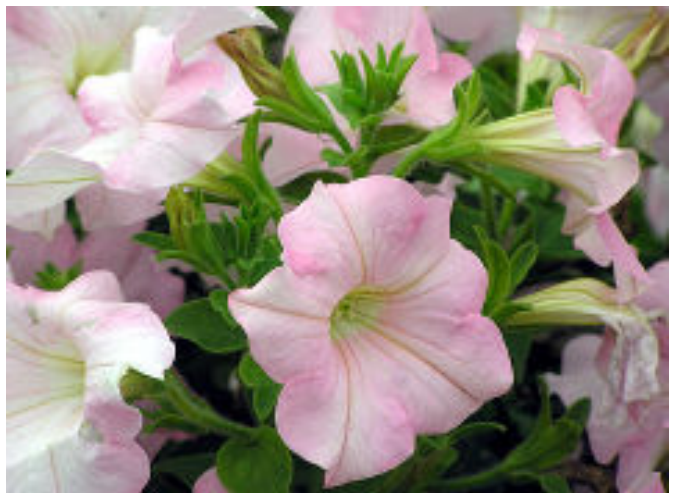
Petunia × hybrida (Grandiflora) 'Dreams Appleblossom'