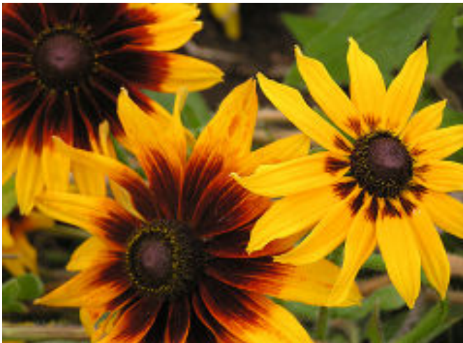
Rudbeckia hirta 'Denver Daisy'