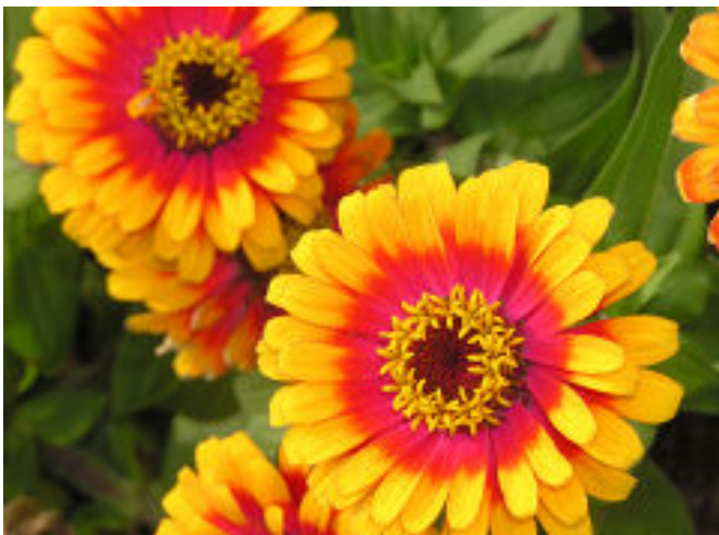
Zinnia elegans 'Zowie! Yellow Flame'