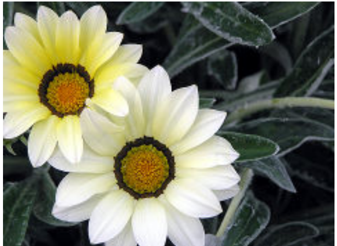
Gazania splendens 'Kiss Frosty Mix'