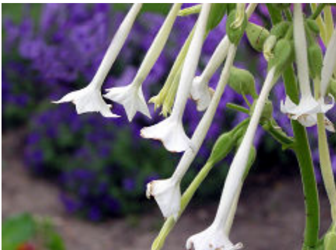
Nicotiana sylvestris (Flowering tobacco) 'Only the Lonely'