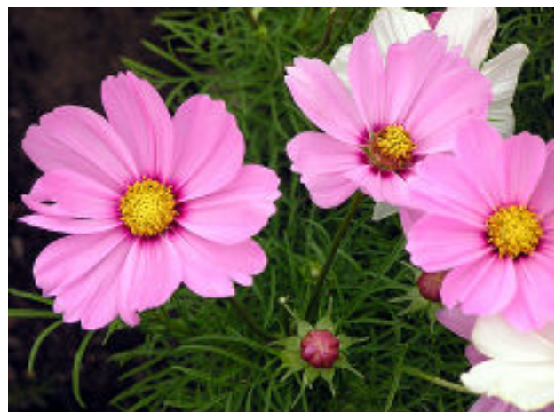
Cosmos bipinnatus 'Sonata Mix'