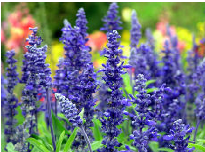
Salvia farinacea 'Victoria'