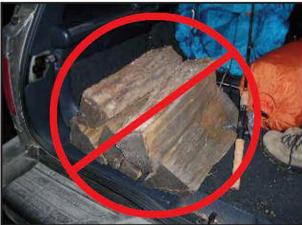
Emerald ash borer is spread to new areas by infested firewood.