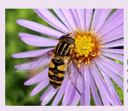
Figure 6. Syrphid flies visiting a Symphyotrichum sp. flower.