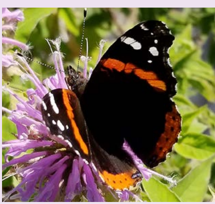
d) Red admiral butterfly visiting a Monarda sp. flower.