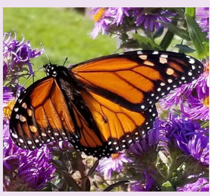
b) Monarch butterfly perching on a Symphyotrichum novae-angliae flower.