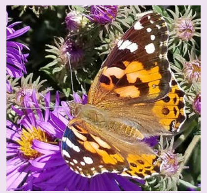
a) Painted lady butterfly visiting a Symphyotrichum novae-angliae flower.