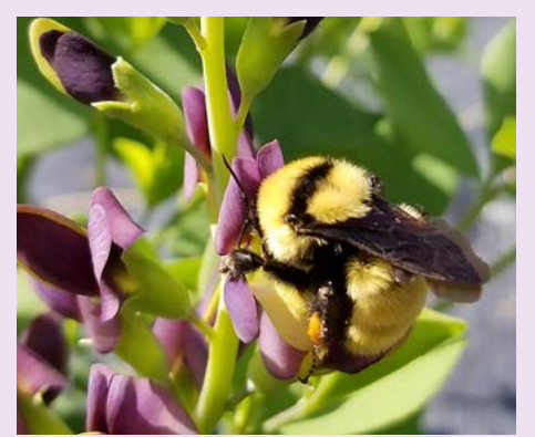
Figure 3. Bumble bee visiting a Baptisia 'Indigo Spires' flower.