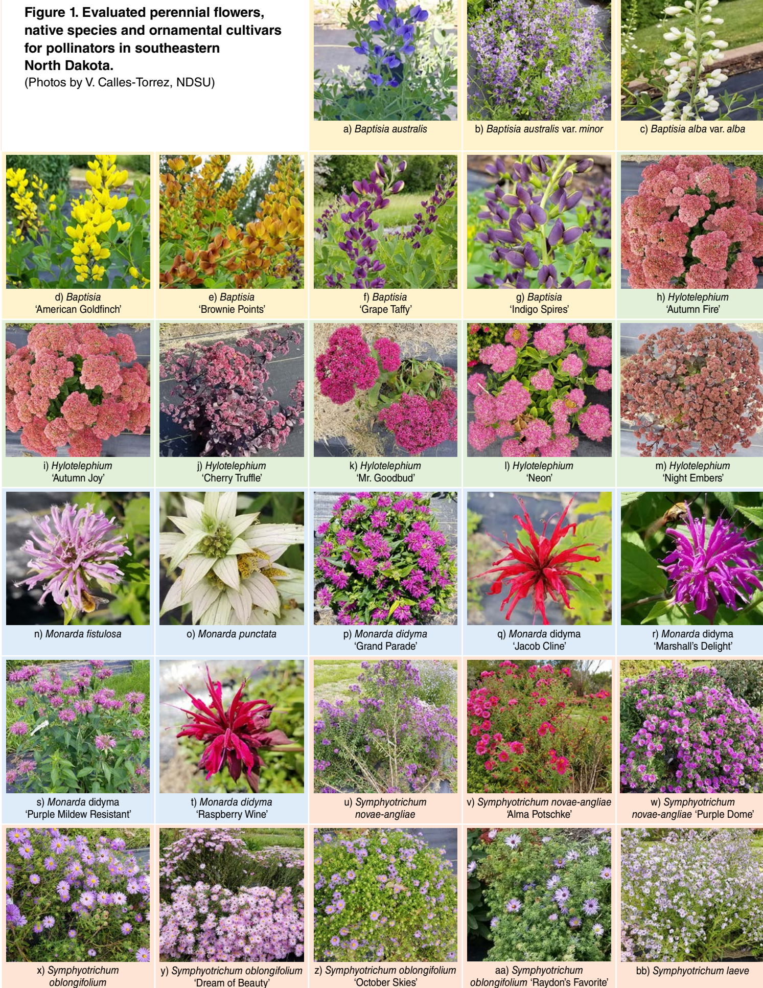
Figure 1. Evaluated perennial flowers, for pollinators in southeastern North Dakota.