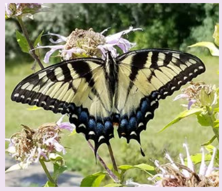
f) Swallowtail butterfly visiting a Monarda fistulosa flower.