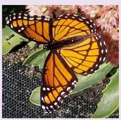
c) Viceroy butterfly perching on a Hylotelephium sp. flower.