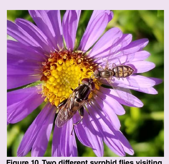
Figure 10. Two different syrphid flies visiting a Symphyotrichum sp. flower. (V. Calles-Torrez, NDSU)