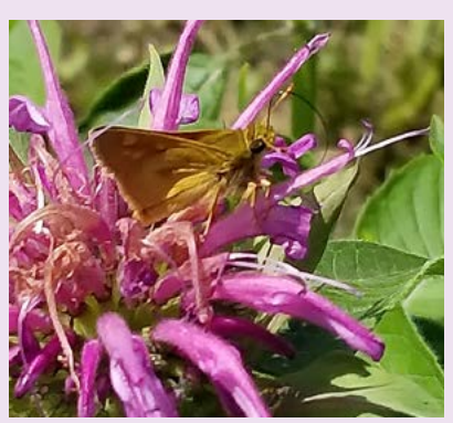
e) Skipper butterfly visiting a Monarda didyma 'Purple Mildew Resistant' flower.