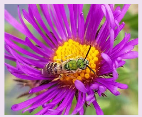
Figure 2. Wild bee (Halictidae) visiting a Symphyotrichum novae-angliae 'Purple Dome' flower.