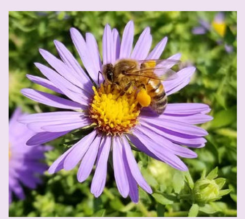
Figure 4. Honey bee collecting pollen from a Symphyotrichum sp. flower. Note the pollen basket on its hind legs.