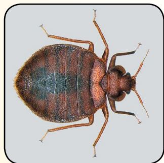
Figure 1. Adult bed bug (P. Beauzay, Dept. of Entomology, NDSU)

Bed bugs belong to the family Cimicidae, which contains many similar species. In our area, bat bugs ( Cimex adjunctus ) and swallow bugs ( Oeciacus vicarius ) are occasionally found in homes. As their names imply, bat bugs attack bats and swallow bugs attack swallows. These species are very similar in appearance to the common bed bug. Therefore, all bed bug identifications should be confirmed by an entomologist. All are blood feeders. The presence of bat bugs indicates the presence of bats roosting in the home, probably in the attic. Swallow bugs can move into the home after the birds have fledged and left their nests. Bat bugs and swallow bugs can and will feed on humans.