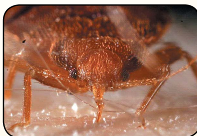
Figure 4. Close-up of bed bug feeding on human