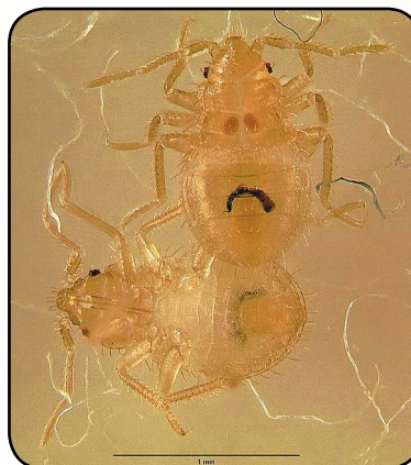
Figure 10. First instar bed bugs caught on a sticky trap