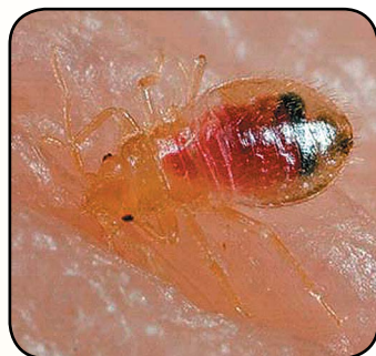
Figure 2. First instar nymph bed bug feeding on human