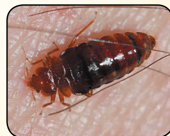
Figure 5. Engorged adult bed bug after feeding