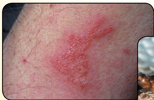
Figure 6. Bed bug bites on human arm causing inflammation

Several types of bed bug traps are available. Sticky traps or glue boards have not been very successful in monitoring for bed bugs (Fig. 10). Because bed bugs are attracted to carbon dioxide and chemical cues such