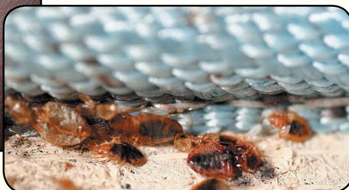
Figure 7. Adult, nymphs and blood spots on fabric of box spring