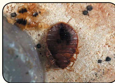
Figure 8. Adult, nymphs and blood spots on the underside of a recliner