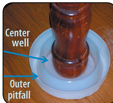
Figure 11. Climbup™ trap for monitoring bed bugs