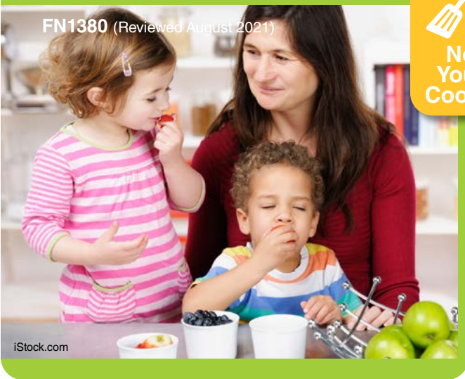
FN1380 (Reviewed August 2021)