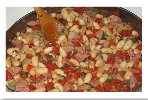
NDSU Extension Service

Makes 10 servings. Per serving: 330 calories, 8 g fat, 26 g protein, 38 g carbohydrate, 7 g fiber and 190 mg sodium