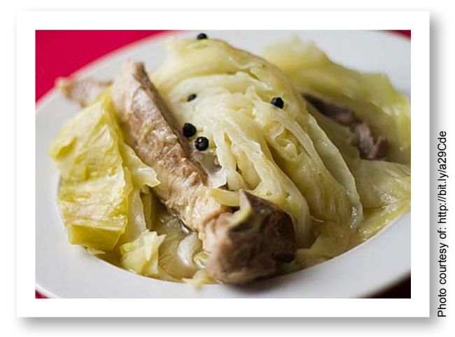
Fårikål (Lamb and Cabbage Stew)*