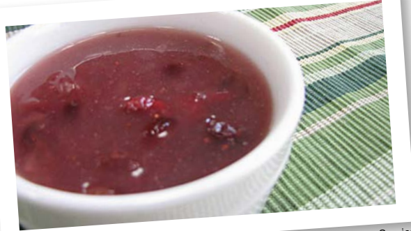
NDSU Extension Service