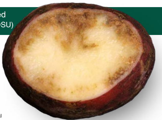
Figure 2. Late blight in seed tuber.

NDSU Extension does not endorse commercial products or companies even though reference may be made to tradenames, trademarks or service names.