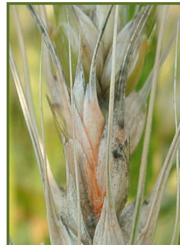
Figure 3. Salmon-orange spores of Fusarium graminearum visible on glumes of wheat.