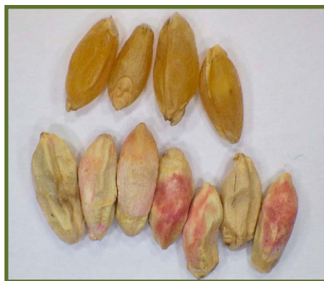
Figure 4. Healthy durum kernels (top) and Fusarium-infected durum kernels (bottom). Note chalky white to pink discoloration of infected kernels. (Andrew Friskop, NDSU)

discoloration yet still harbor mycotoxins. Infected kernels of durum often lose their amber translucence and appear chalky or opaque. Symptoms in barley include brown, water-soaked to bleached spikelets (Figure 5A, 5B). Severely infected barley kernels at harvest may show a pinkish discoloration (Figure 6). Although rare, salmon-orange spore masses of the fungus can be seen on the infected spikelet and glumes in barley during prolonged periods of wet weather. Estimates of FHB levels in a field are based on counts of blighted heads or kernels. A colored visual scale to estimate the severity of FHB in wheat is available from NDSU Extension (publication PP1095). Samples of diseased heads and/or grain suspected of containing scabby kernels can be submitted to Extension's county offices or the Plant Diagnostic Laboratory at NDSU (nominal fee) for diagnosis.