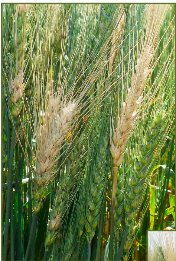
Figure 1. Wheat heads showing bleached spikelets as a result of Fusarium infection.