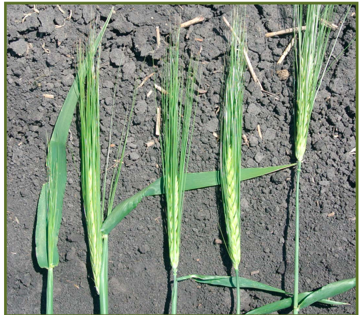
Figure 8. Barley growth stages from left are boot stage, one-half spike emergence, full spike, one to three days after full spike and three to seven days after full spike.