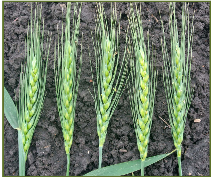
Figure 7. Wheat growth stages from left are three-fourths spike emergence, full spike, early flowering, one to three days after early flowering and three to seven days after early flowering.