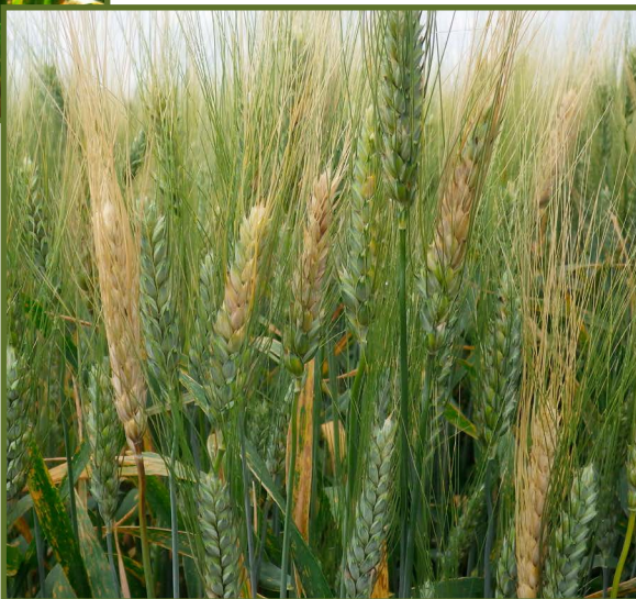
Figure 2. Susceptible durum variety with numerous grain heads with FHB.

Infected wheat and durum kernels are shriveled, lightweight and dull grayish or pinkish (Figure 4). These kernels sometimes are called “tombstones” because of their chalky, lifeless appearance. If infection occurs late in kernel development, Fusarium-infected kernels may be normal in size with slight